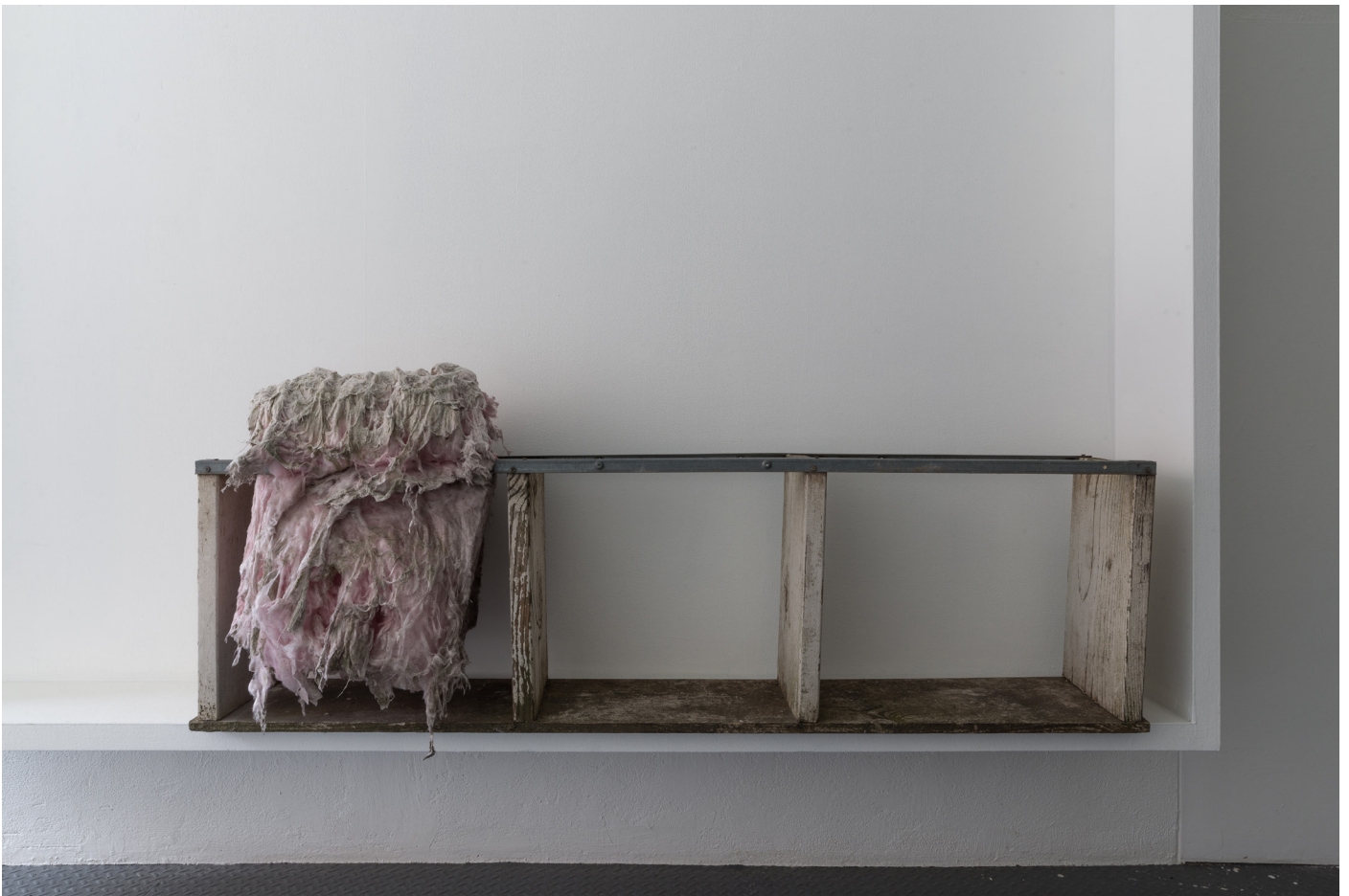
Against Attachment , 2019, Ludlow 38, New York, USA, exhibition view