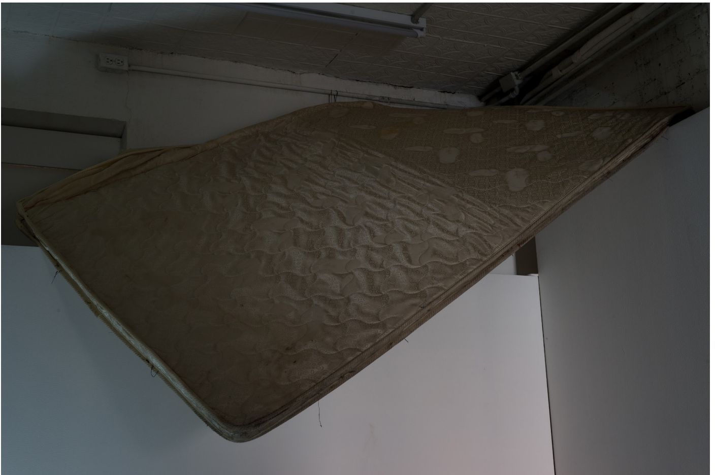
Against Attachment , 2019, Ludlow 38, New York, USA, exhibition view