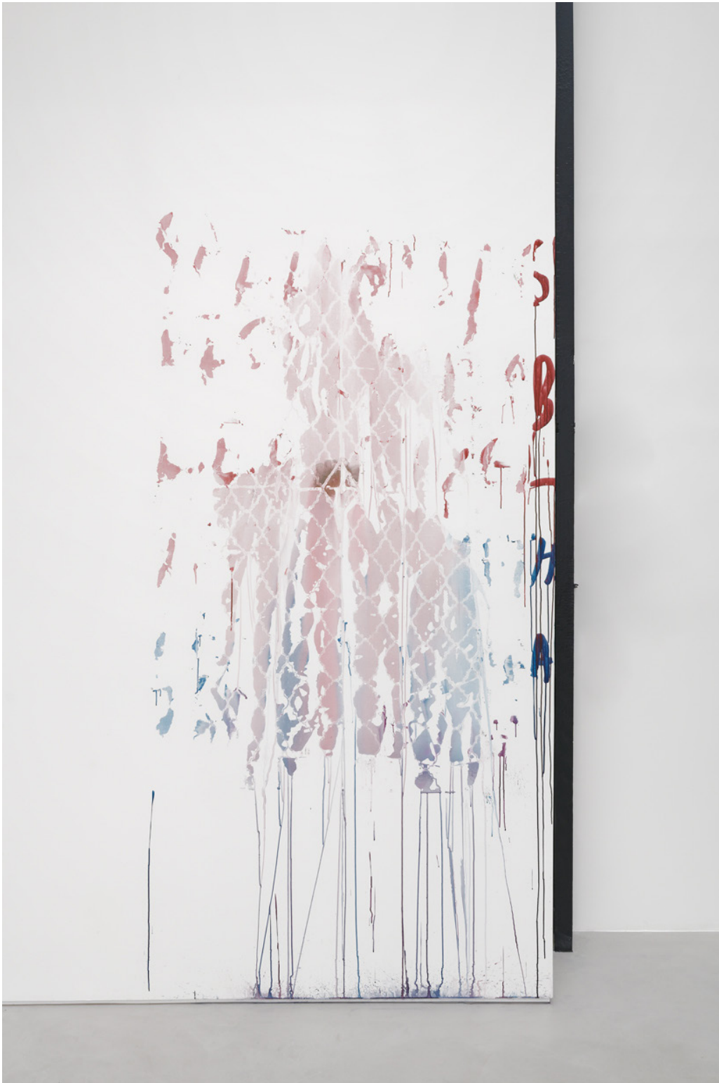
INFILTRÉES – 5 manières d'habiter le monde , Prix Reiffers Art Initiatives 2023, Accacias Art Center, Paris, France, exhibition view