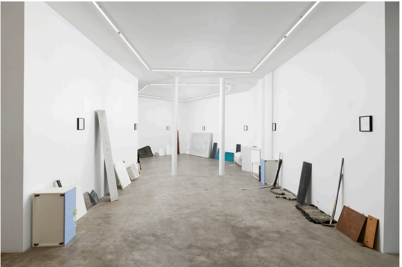
Ser Serpas , 2021, Balice Hertling, exhibition view