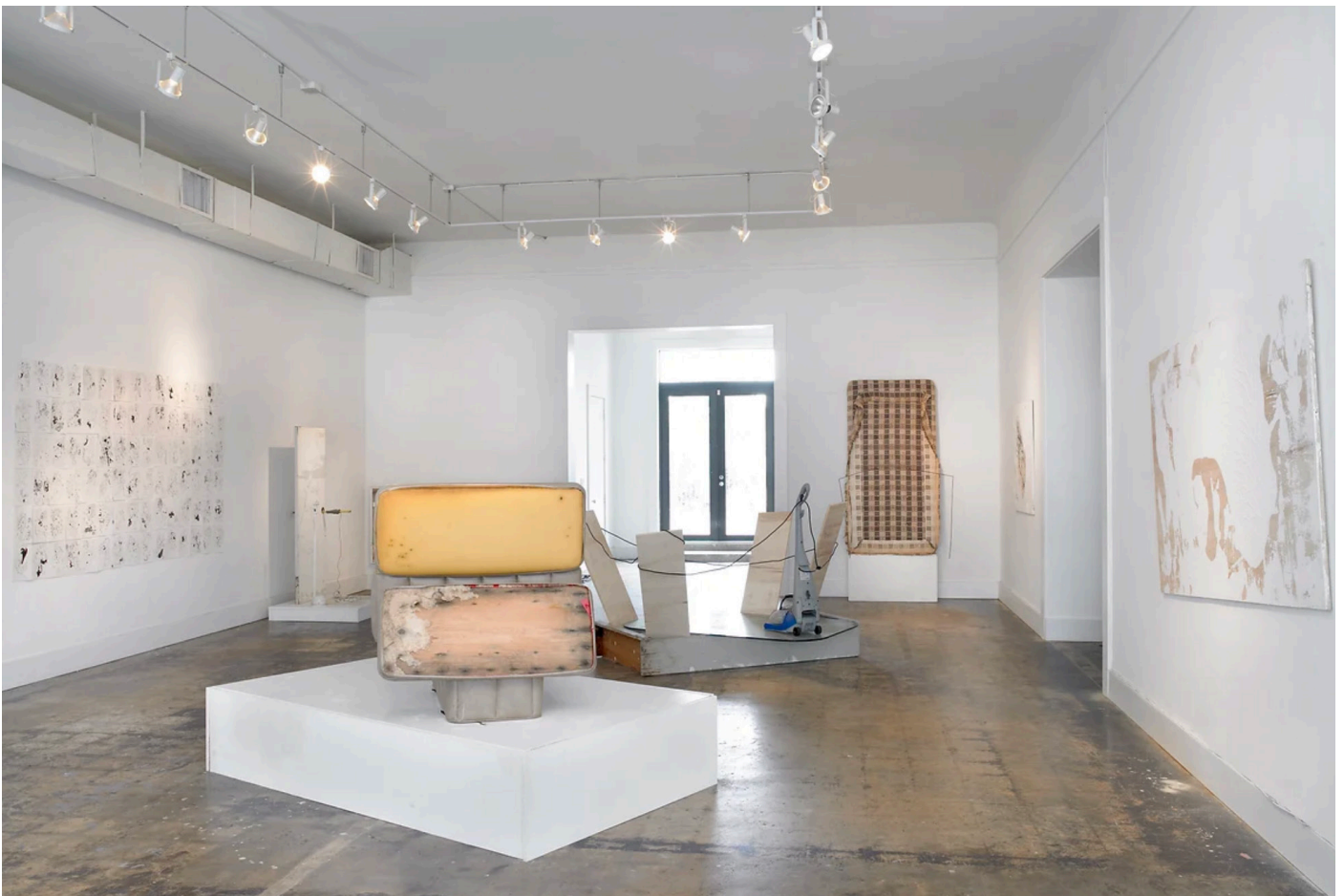
Dust Patterns , 2018, Current Projects, Miami, USA, exhibition view