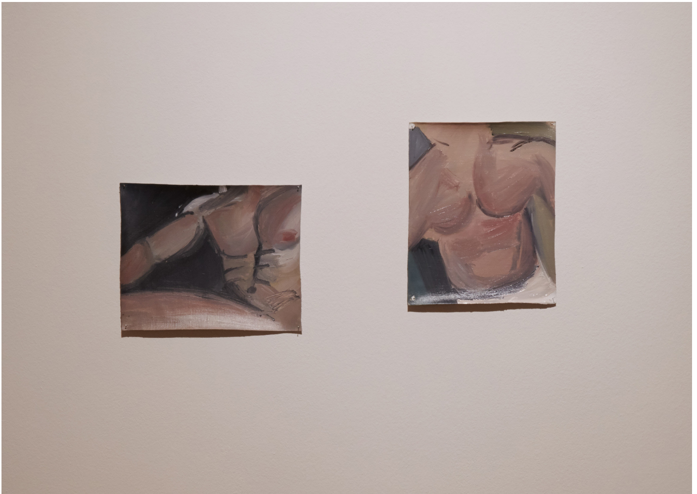
A House is not a Home , 2019, Fri Art, Kunsthalle Fribourg, Fribourg, exhibition view