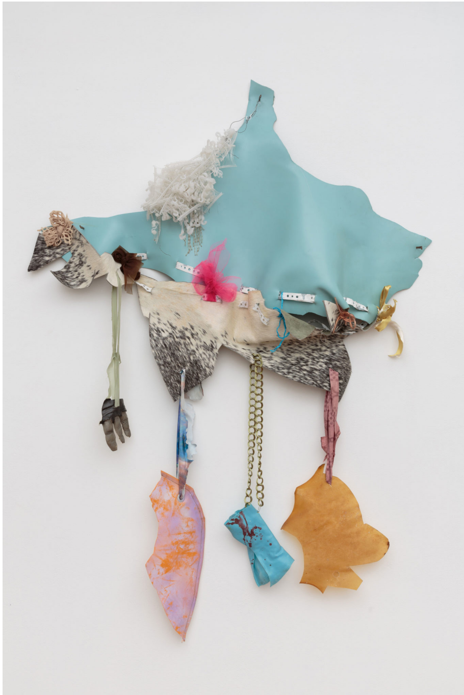
Lickshot dramamine and my ambition flow , 2018 Mixed media 150 × 106 × 17 cm (59 × 41 \frac{3}{4} × 6 \frac{3}{4} inches)