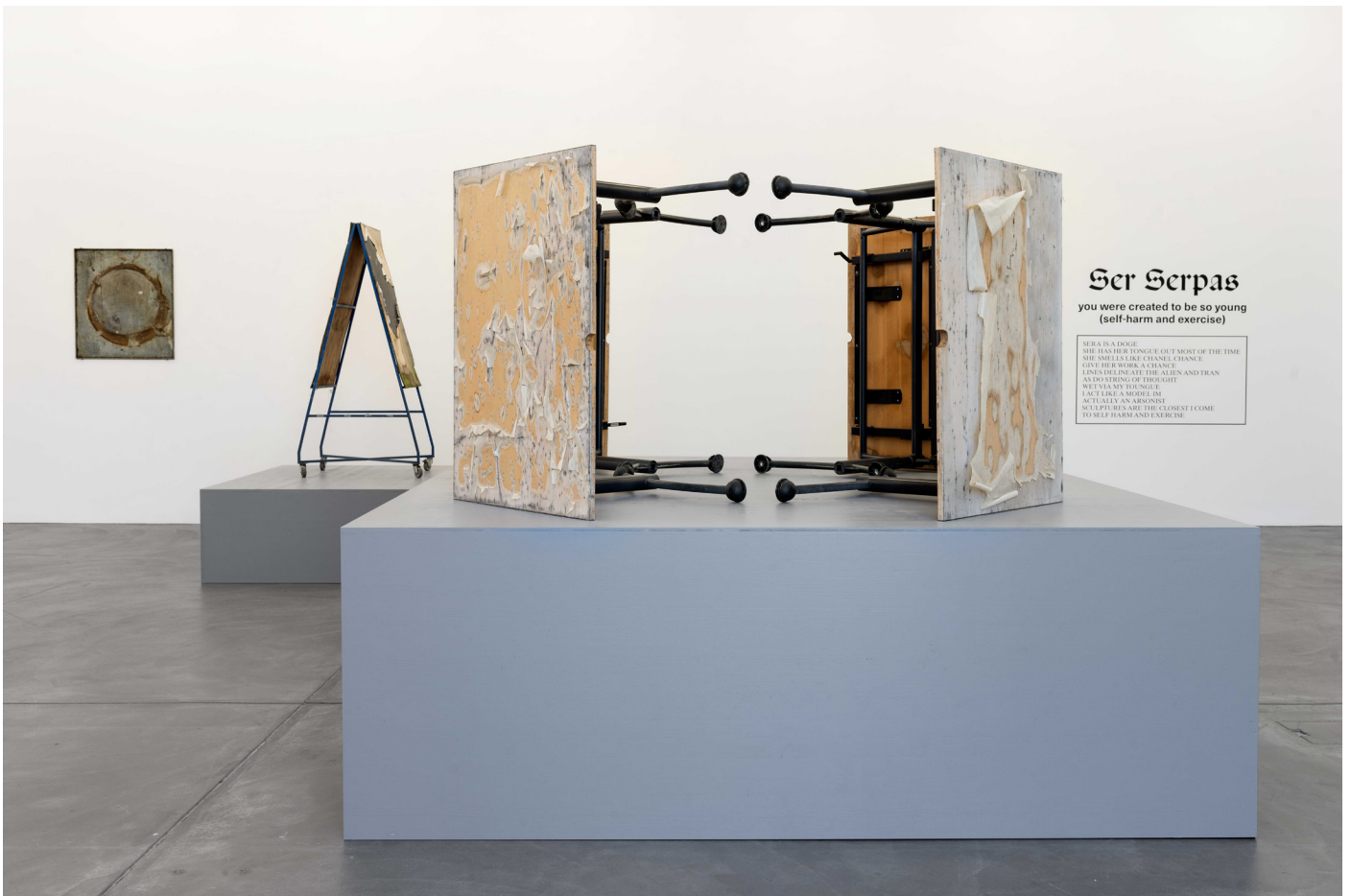
You were created to be so young (self-harm exercise) , 2018, Luma Westbau, Zürich, Switzerland, exhibition view