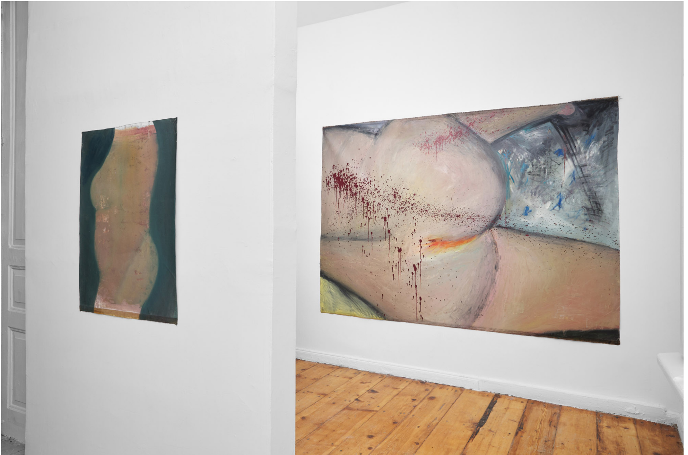
Monakhos, 2022, LC Queisser, Tbilisi, Georgia, exhibition view