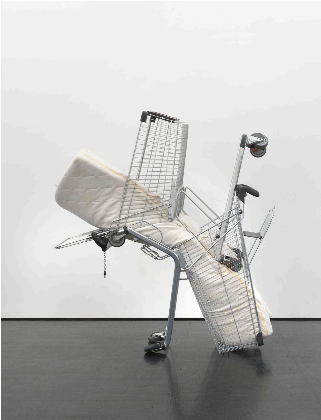
Hand Banger Boogie , 2022, Galerie Barbara Weiss, Berlin, exhibition view