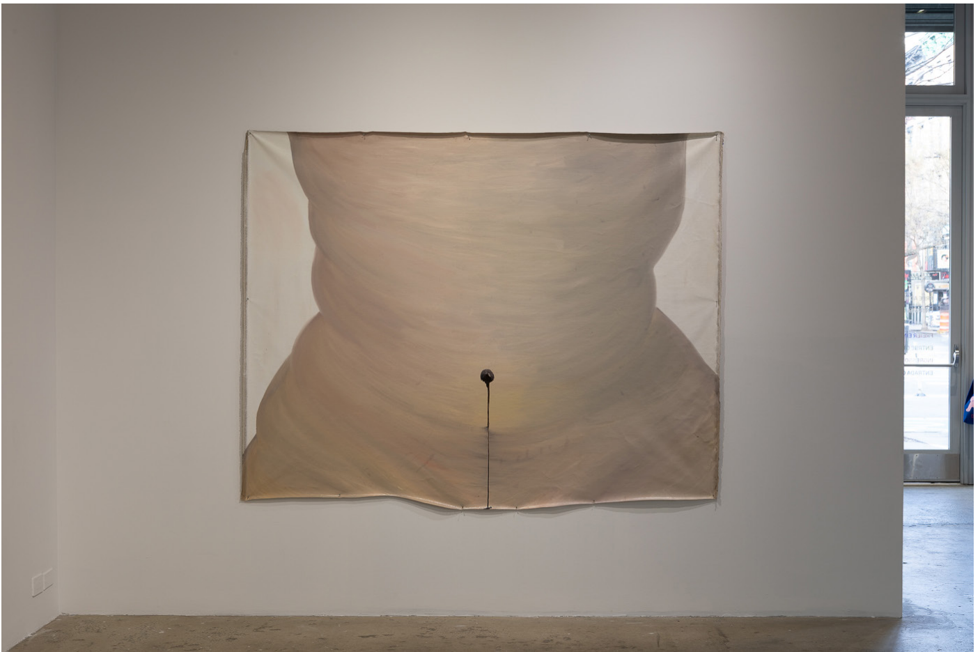
Hall , 2023, Swiss Institute / Contemporary Art, New York, USA, exhibition view