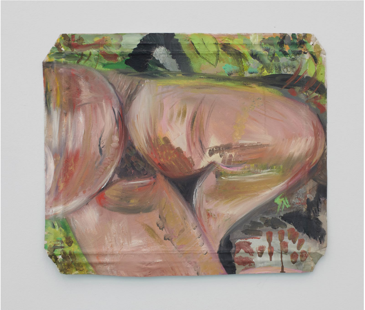
Untitled, 2020 Oil on canvas 46 x 53 cm (18 1/8 x 20 7/8 in.)