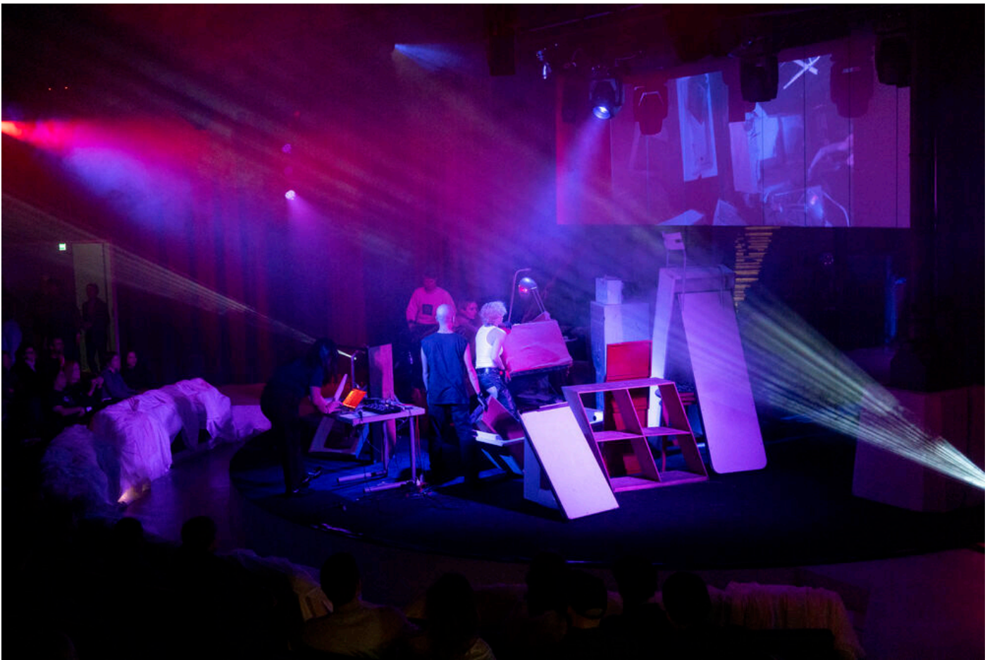
Basement Scene , 2024, Bourse de Commerce - Pinault Collection, Paris, France, performance