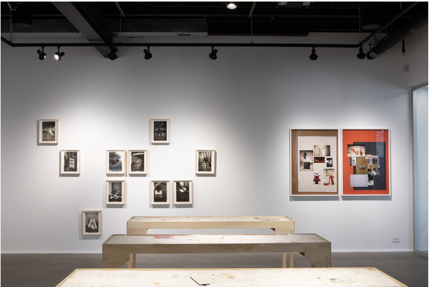
Hall , 2023, Swiss Institute / Contemporary Art, New York, USA, exhibition view