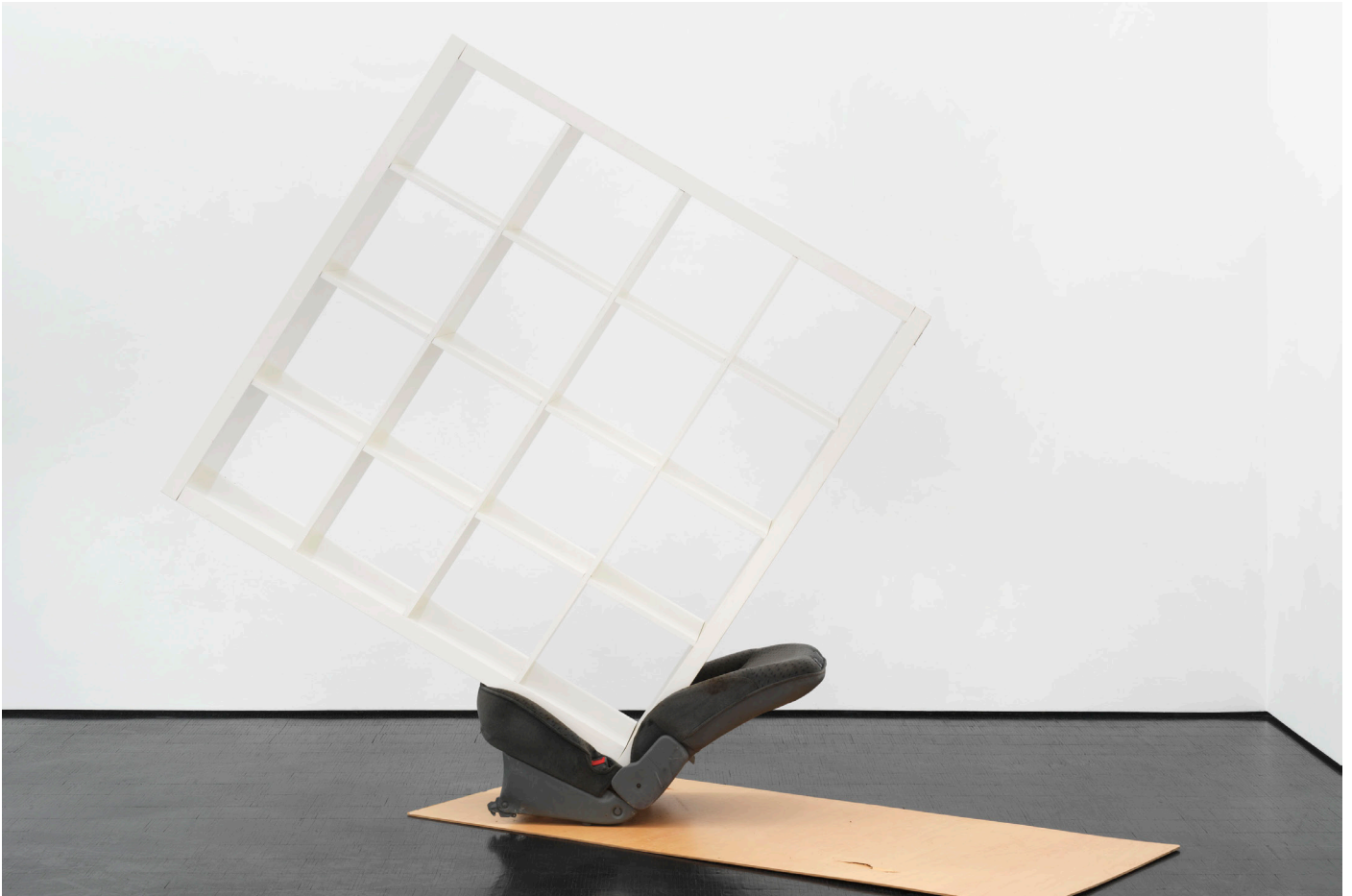
Hand Banger Boogie , 2022, Galerie Barbara Weiss, Berlin, exhibition view