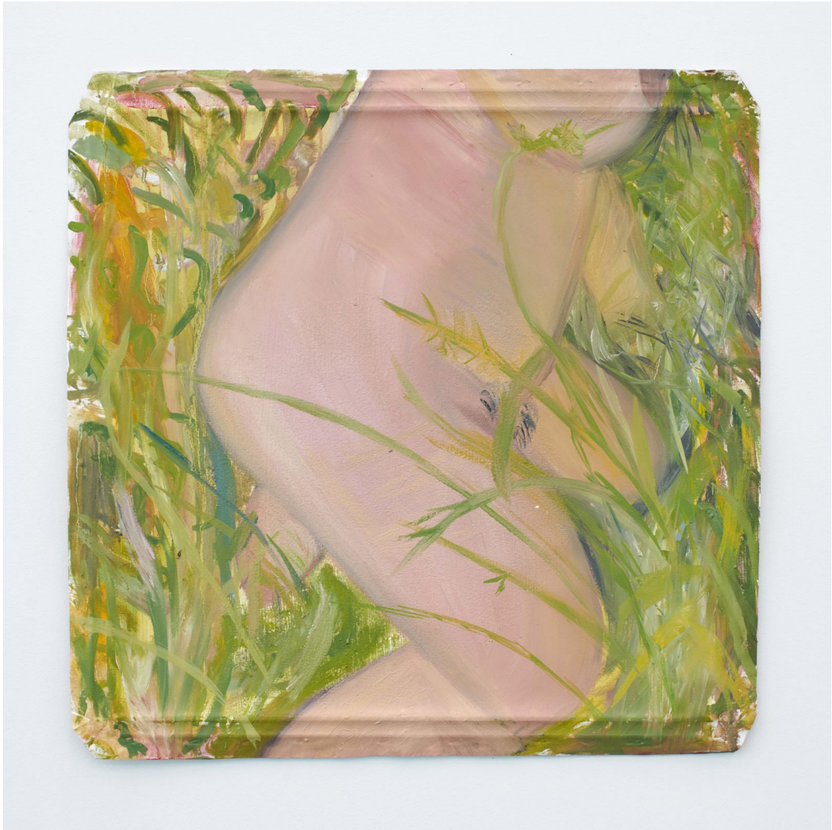
Untitled, 2020 Oil on canvas 68 x 68 cm ( 26 3/4 x 26 3/4 in )