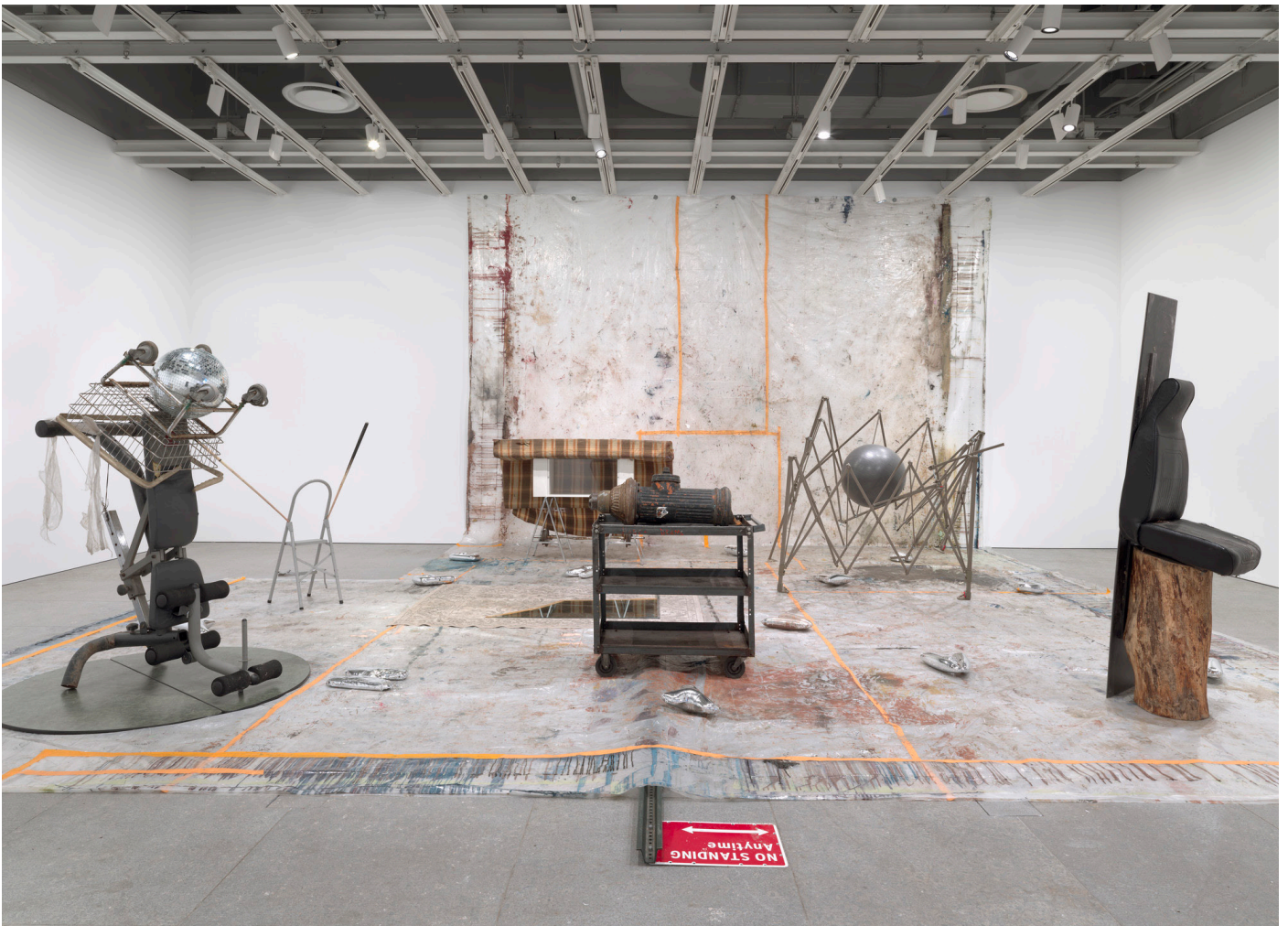
Whitney Biennial 2024: Even Better Than the Real Thing , 2024, Whitney Museum New York, USA, exhibition view