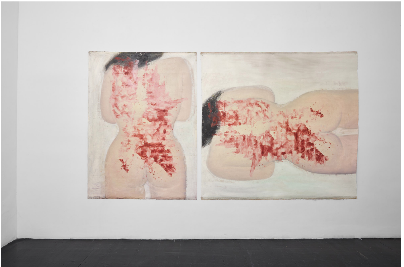
Monakhos , 2022, LC Queisser, Tbilisi, Georgia, exhibition view