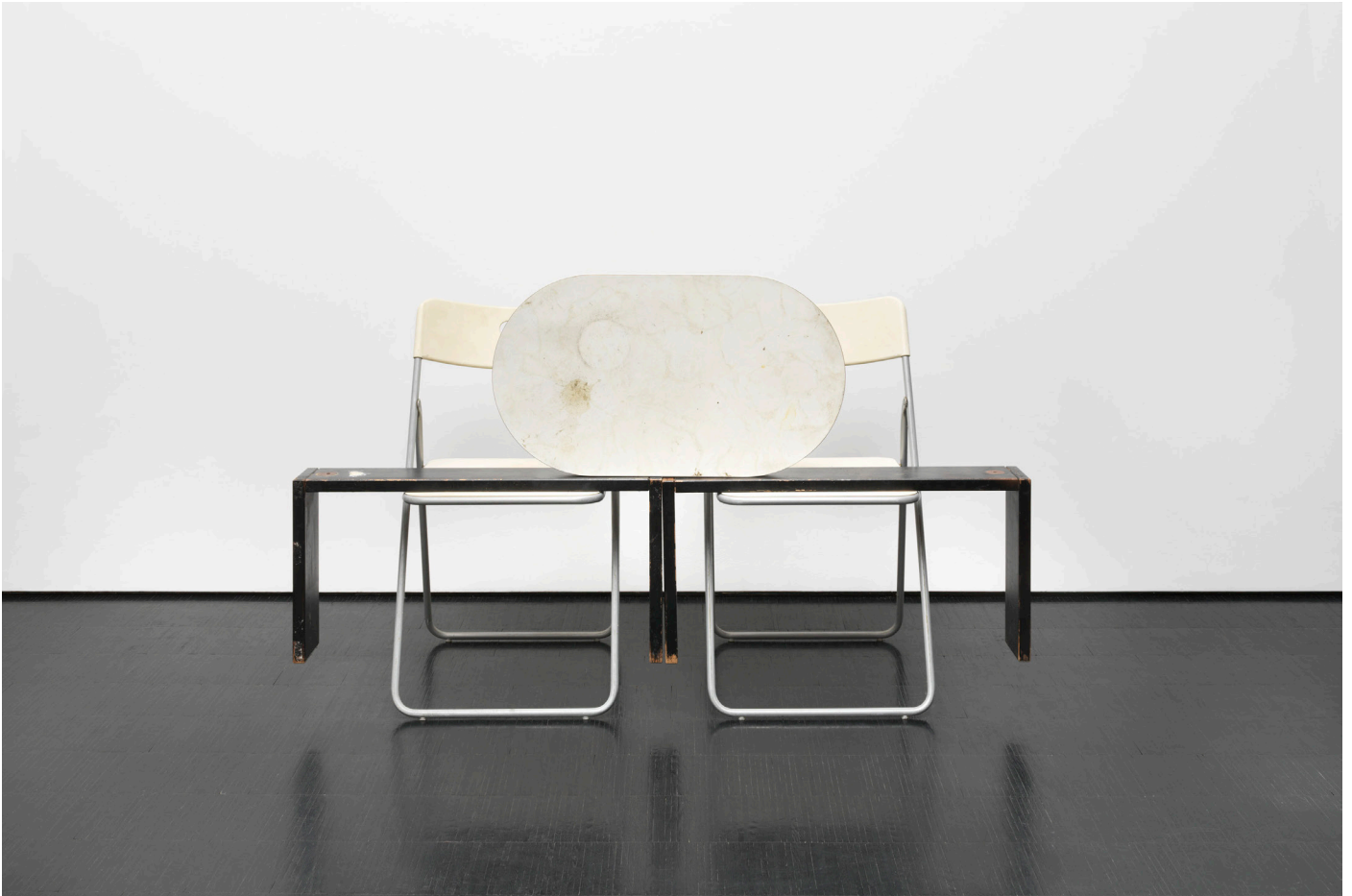
Hand Banger Boogie , 2022, Galerie Barbara Weiss, Berlin, exhibition view