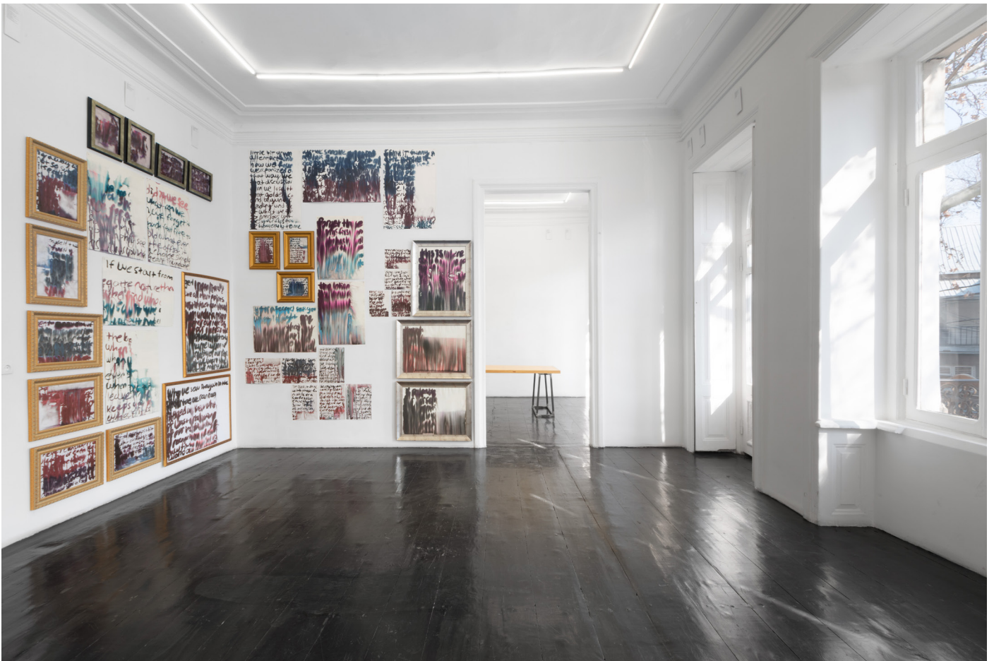
Guesthouse , 2021, LC Queisser, Tbilisi, Georgia, exhibition view