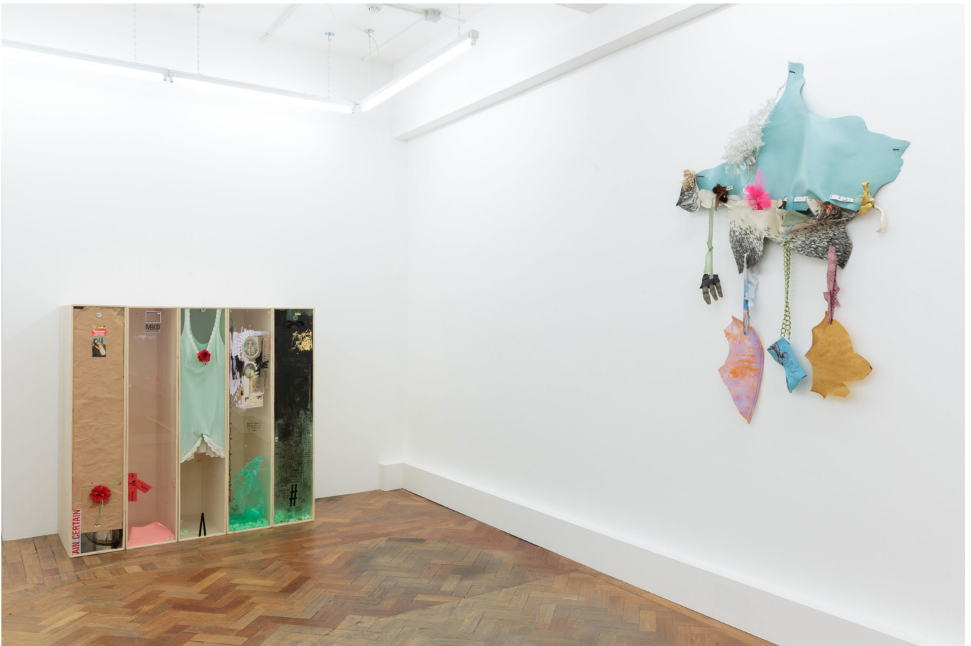
Notes on Entropy , 2020, Arcadia Missa, London, UK, exhibition view