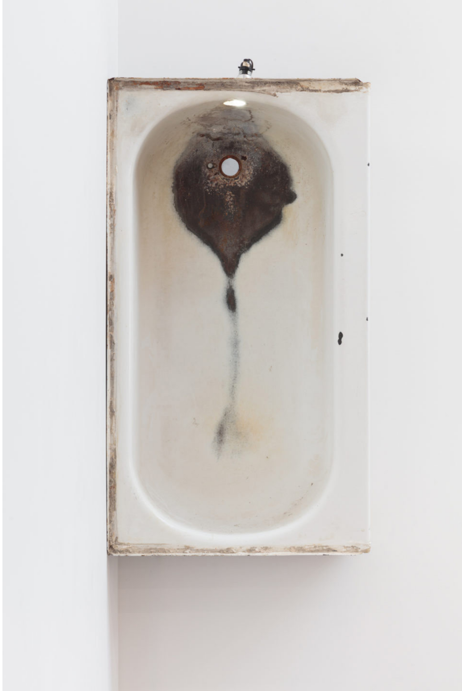
brooklyn baby , 2018 Found bathub, clamp light 137.7 x 76.2 x 37.4 cm (54 1/2 x 30 x 14 3/4 in.)