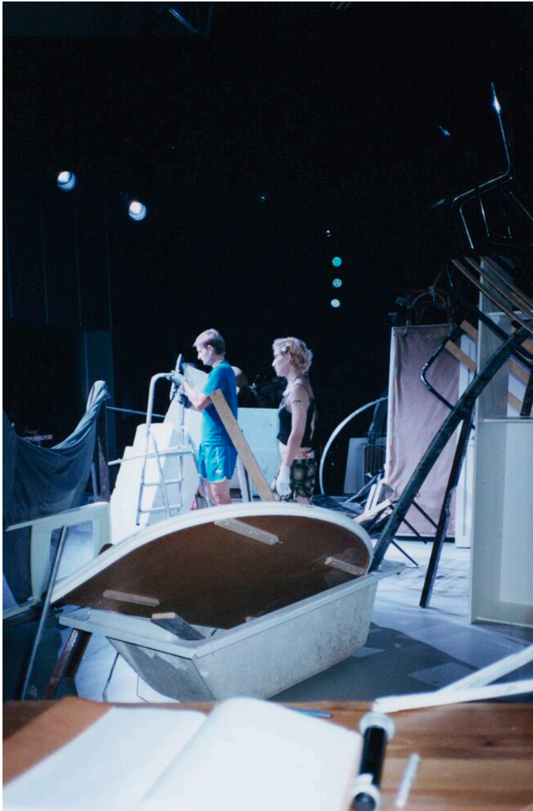
Basement Scene , 2023, Bourse de Commerce - Pinault Collection, Paris, France, performance