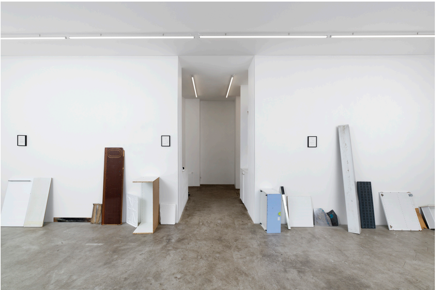
Ser Serpas , 2021, Balice Hertling, exhibition view