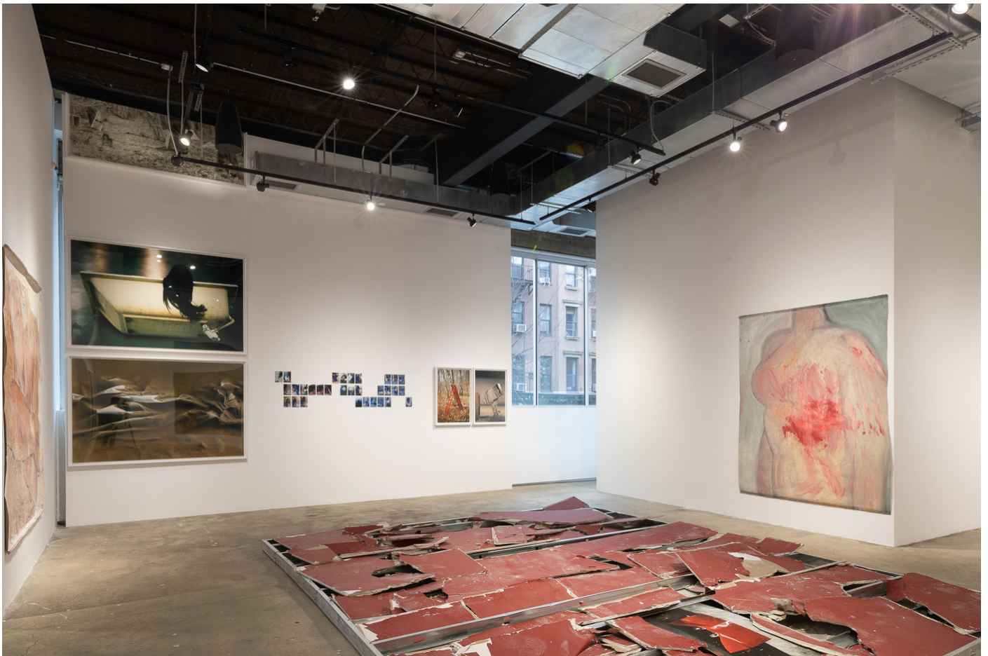
Hall , 2023, Swiss Institute / Contemporary Art, New York, USA, exhibition view