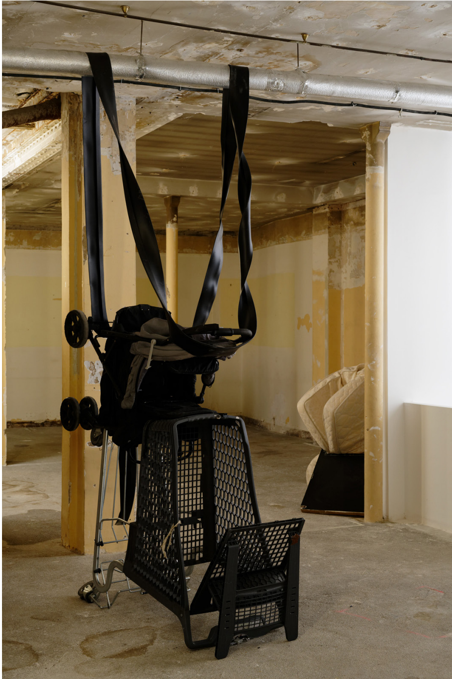
revolutions insect of things , 2021 152 x 282 x 55 cm (59.8 x 111 x 21.6 in.)