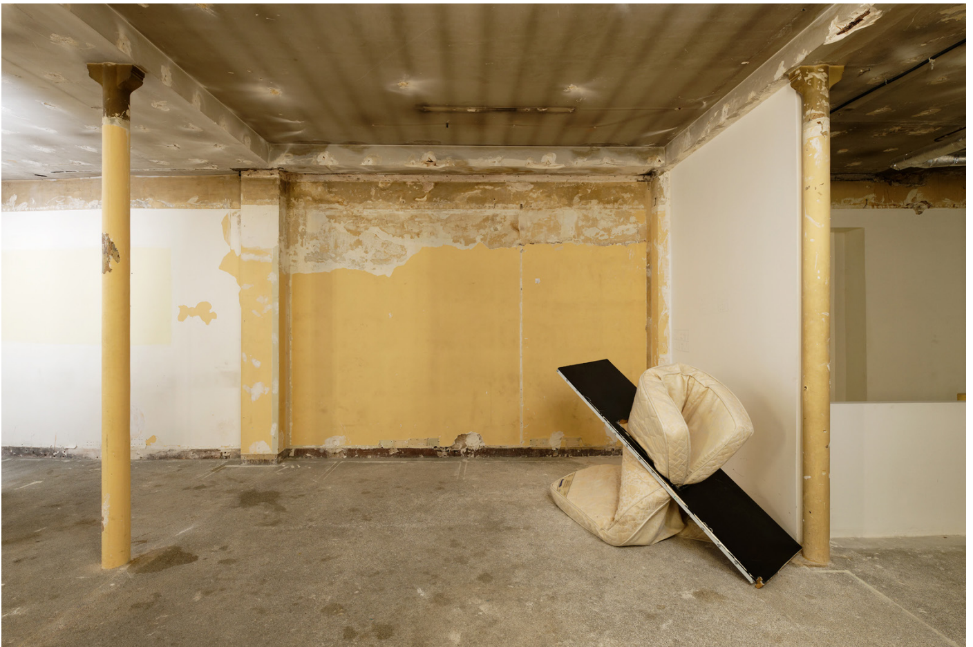
conjoining fabricated excesses literal end to a mean, 2021 117 x 165 x 96 cm (46 x 64.9 x 37.8 in.)