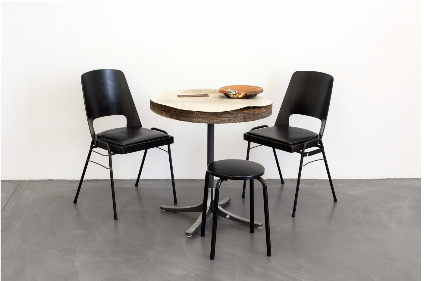
You were created to be so young (self-harm exercise) , 2018, Luma Westbau, Zürich, Switzerland, exhibition view