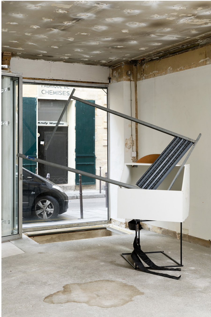
encircled world little tidbits , 2021 233 x 242 x 91 cm (91.7 x 95.2 x 35.8 in.)