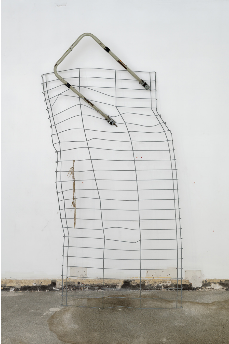
scrambled god living in static machination, 2021 98 x 217 x 33 cm (38.6 x 85.4 x 12.9 in.)