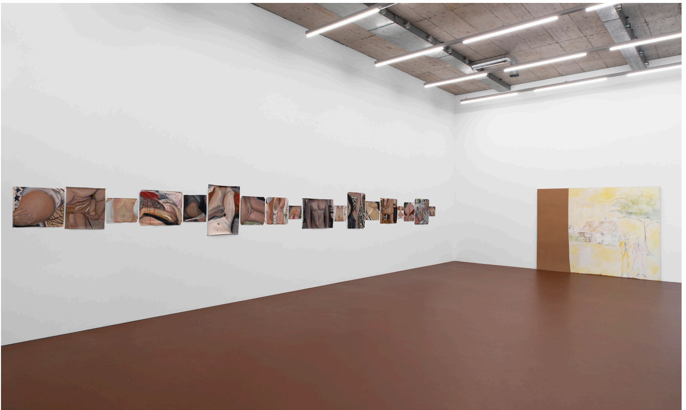
Models , 2020, Karma International, Zurich, Switzerland, exhibition view