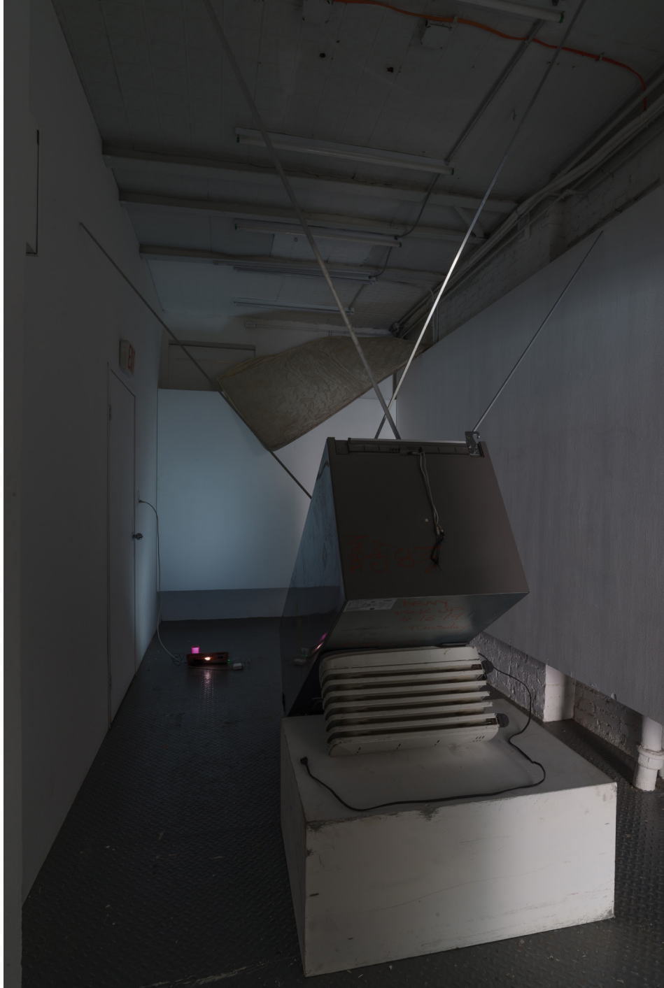
Against Attachment , 2019, Ludlow 38, New York, USA, exhibition view