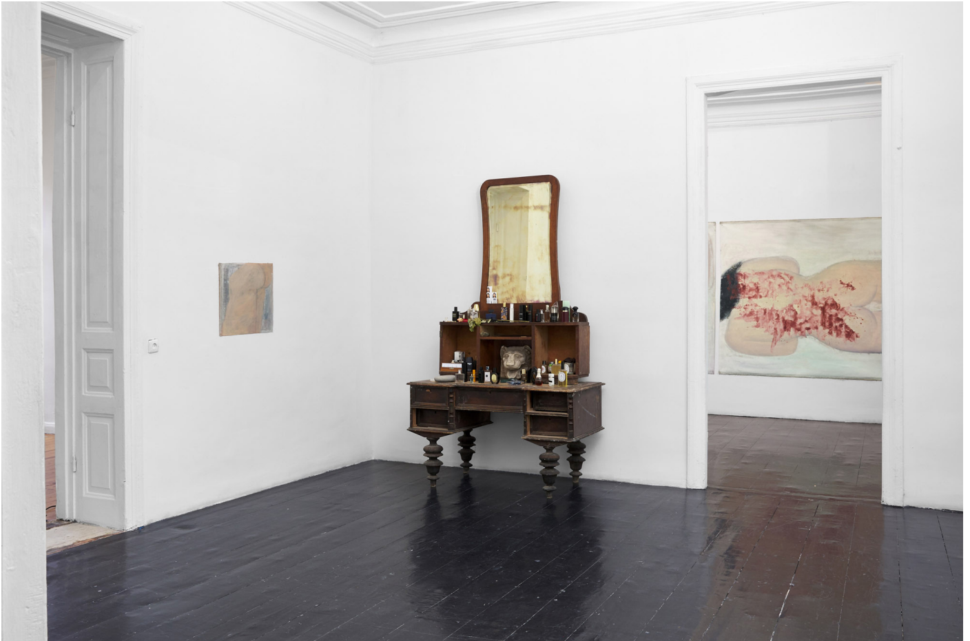
Monakhos , 2022, LC Queisser, Tbilisi, Georgia, exhibition view