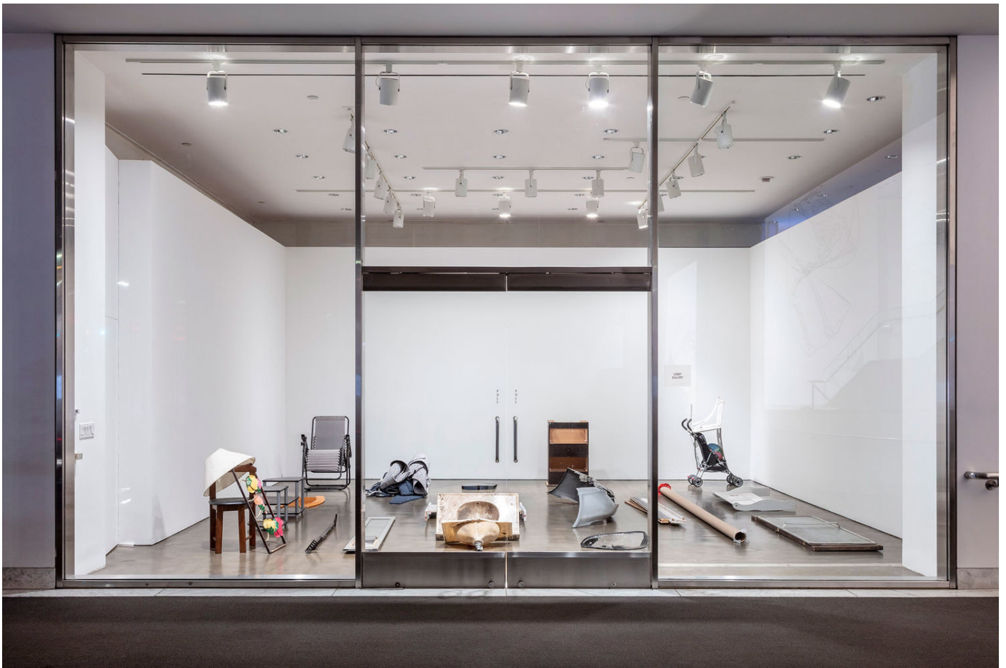
Made in L.A. , 2021, Hammer Museum, Los Angeles, USA, exhibition view