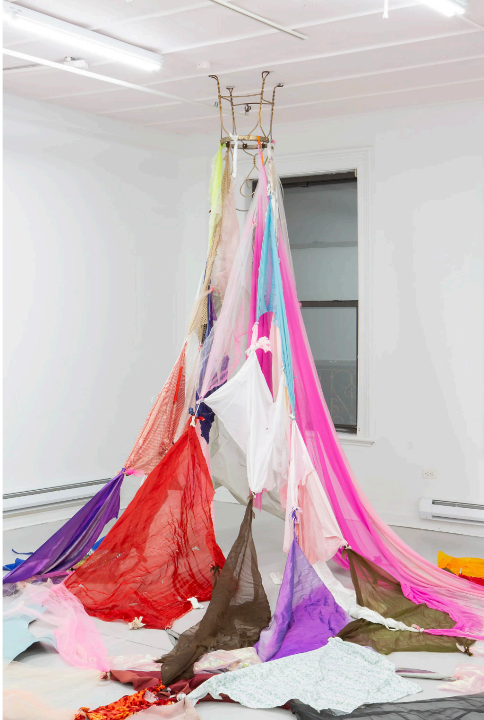
Ben , 2018 Chair, weathered fabric Dimensions variable