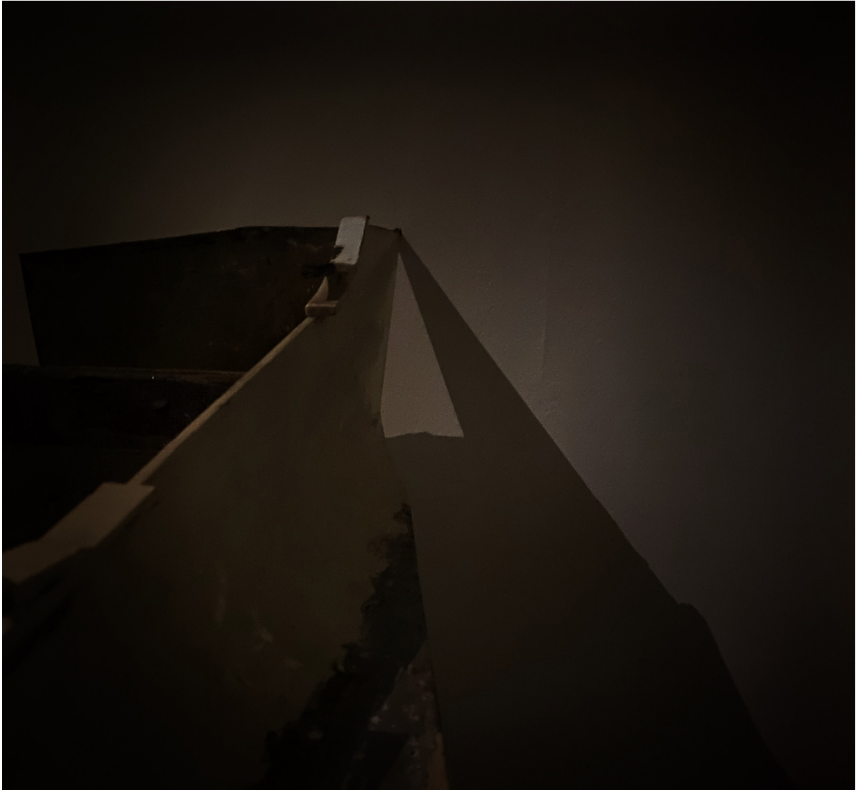
It Depends , 2024, Blank Canvas, Penang, Malaysia, exhibition view