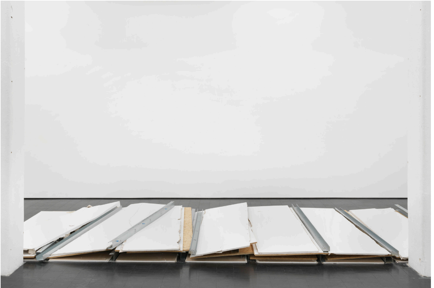
Hand Banger Boogie , 2022, Galerie Barbara Weiss, Berlin, exhibition view