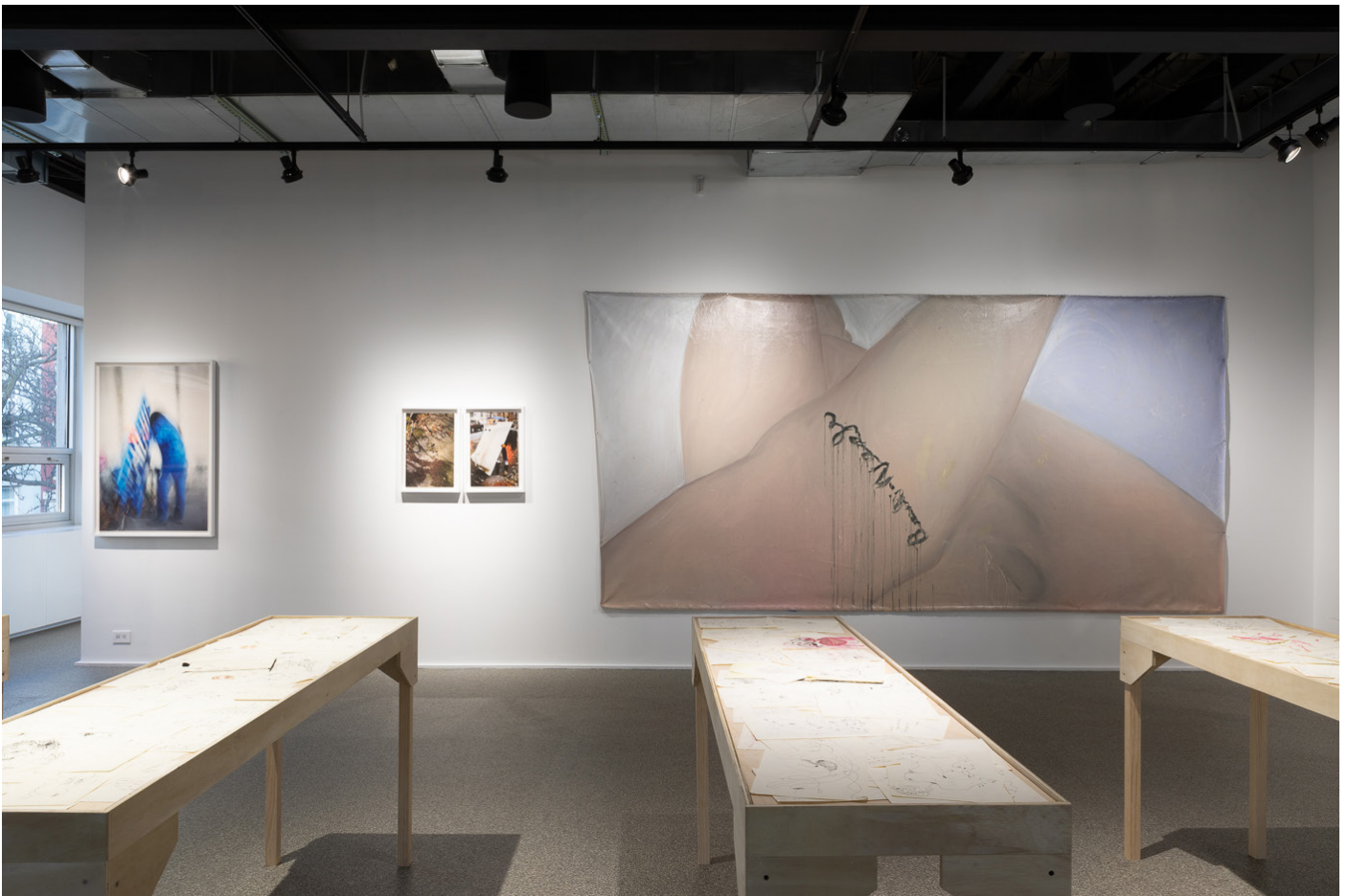
Hall , 2023, Swiss Institute / Contemporary Art, New York, USA, exhibition view