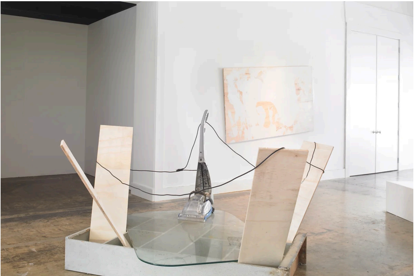
Dust Patterns , 2018, Current Projects, Miami, USA, exhibition view