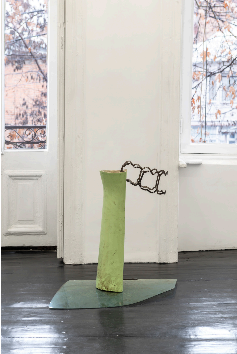
Stars are Blind , 2019, LC Queisser, Tbilisi, Georgia, exhibition view