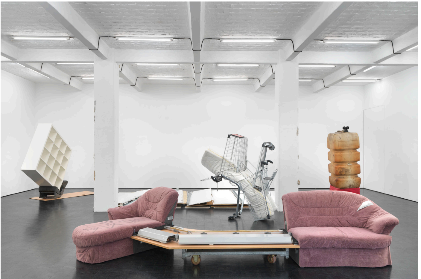
Hand Banger Boogie , 2022, Galerie Barbara Weiss, Berlin, exhibition view