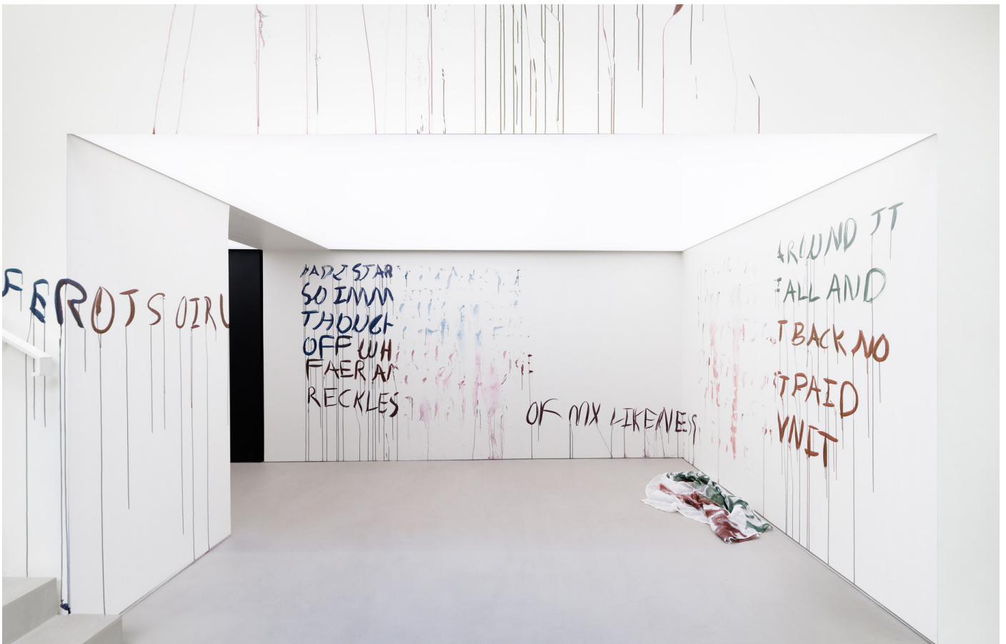
INFILTRÉES – 5 manières d'habiter le monde , Prix Reiffers Art Initiatives 2023, Accacias Art Center, Paris, France, exhibition view