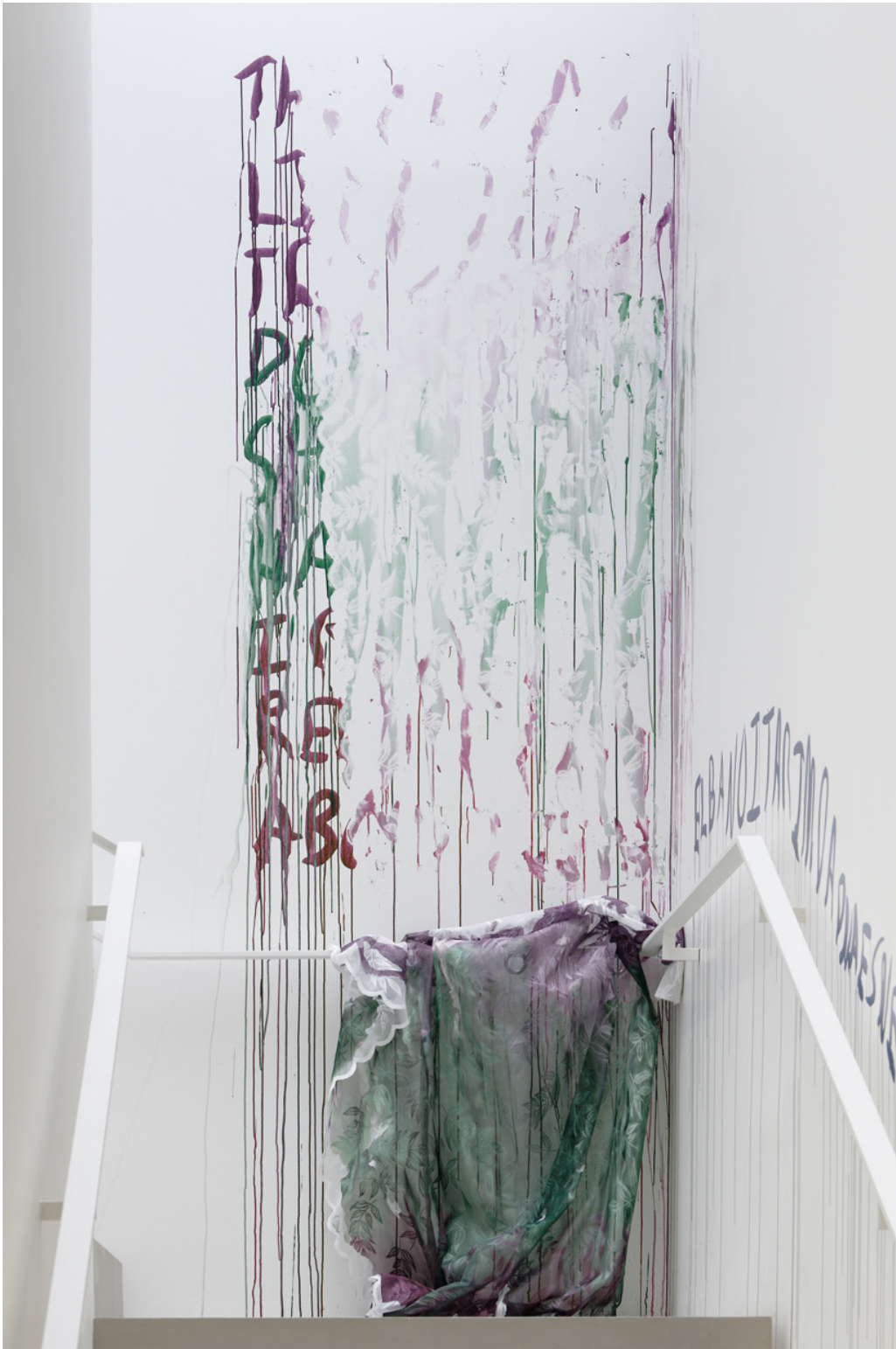
INFILTRÉES – 5 manières d'habiter le monde , Prix Reiffers Art Initiatives 2023, Accacias Art Center, Paris, France, exhibition view