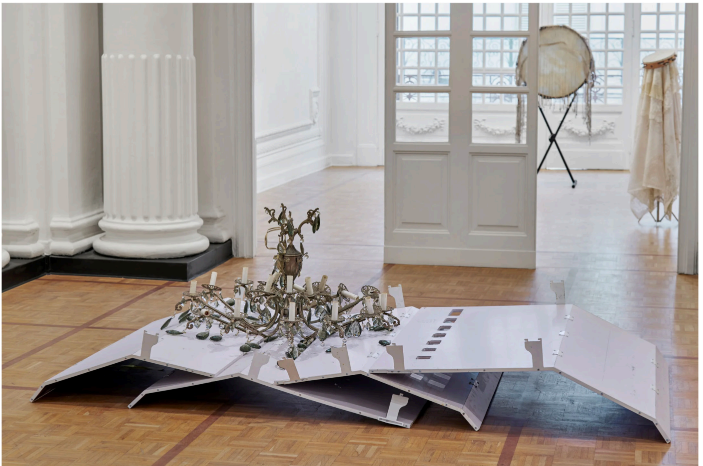
Mettere Al Mondo IL Mondo , 2022, Thomas Dane, Naples, Italy, exhibition view