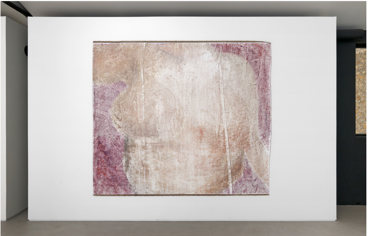
INFILTRÉES – 5 manières d'habiter le monde , Prix Reiffers Art Initiatives 2023, Accacias Art Center, Paris, France, exhibition view