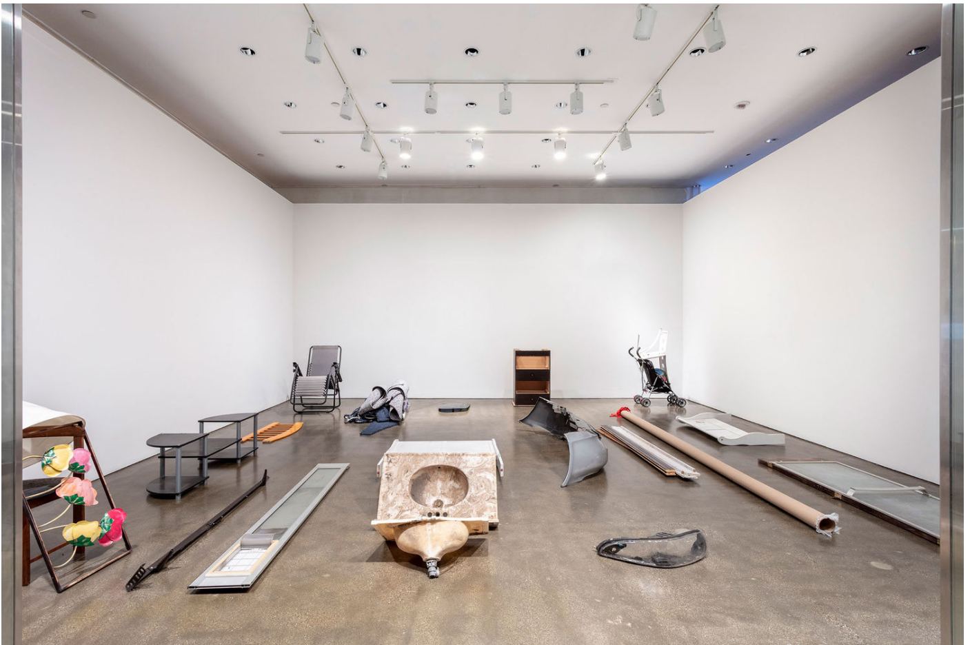
Made in L.A. , 2021, Hammer Museum, Los Angeles, USA, exhibition view