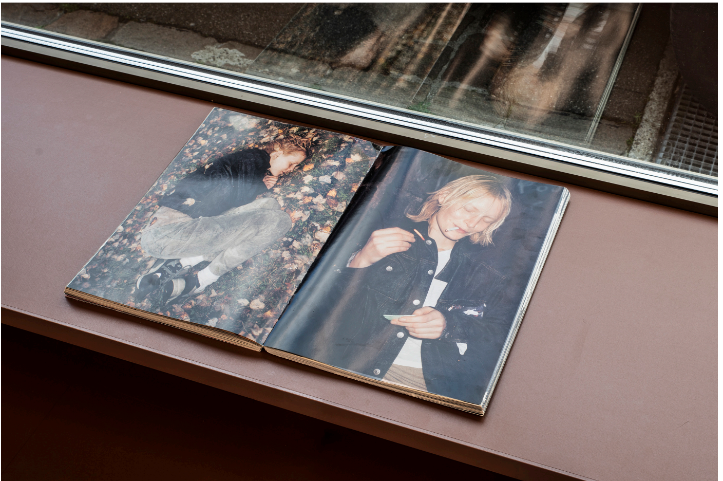
Models , 2020, Karma International, Zurich, Switzerland, exhibition view