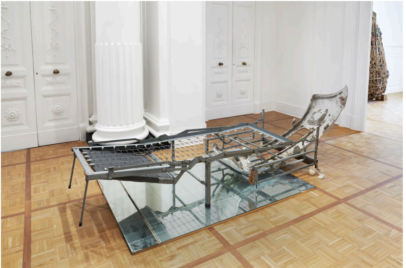
Mettere Al Mondo IL Mondo, 2022, Thomas Dane, Naples, Italy, exhibition view