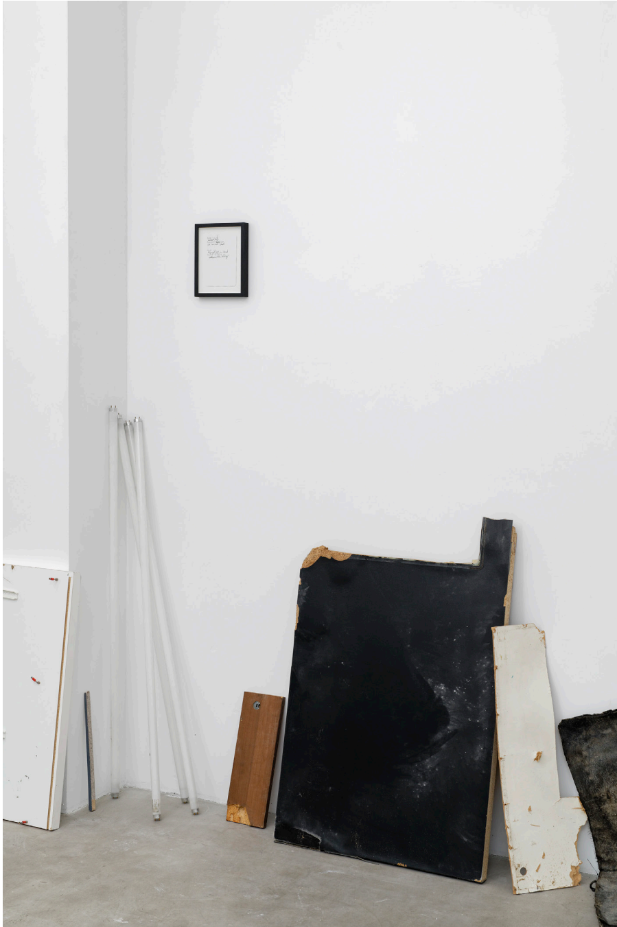
Ser Serpas , 2021, Balice Hertling, exhibition view