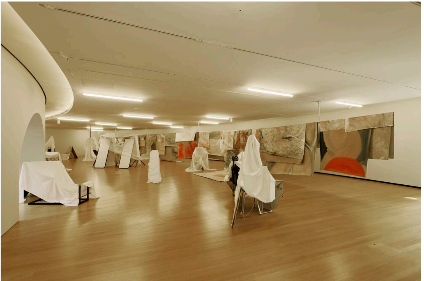
I fear (J'ai peur) , 2023, Bourse de Commerce - Pinault Collection, curated by Caroline Bourgeois, Paris, France, exhibition view