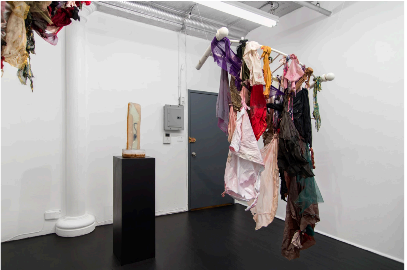
Bare teeth, 2018, Queer Thoughts, New York, USA, exhibition view