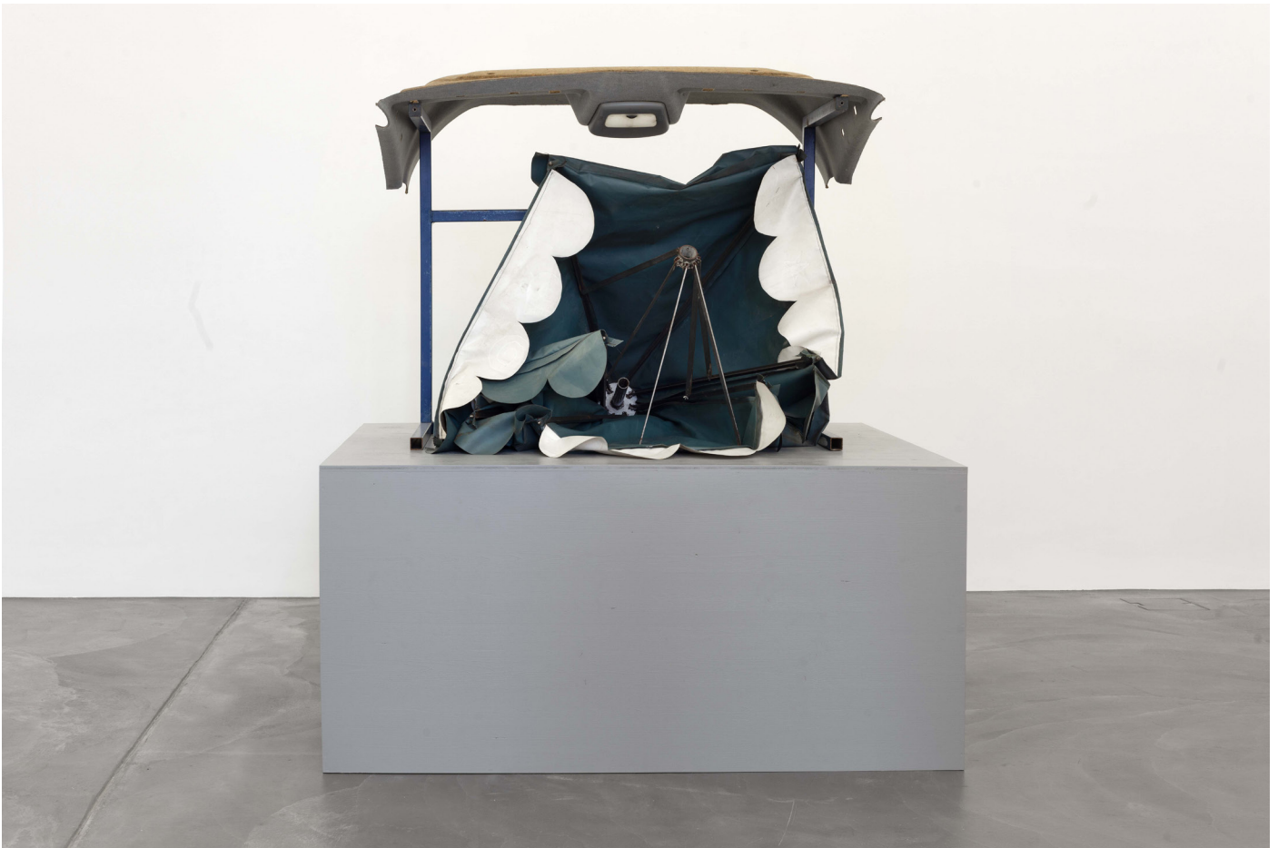
You were created to be so young (self-harm exercise) , 2018, Luma Westbau, Zürich, Switzerland, exhibition view