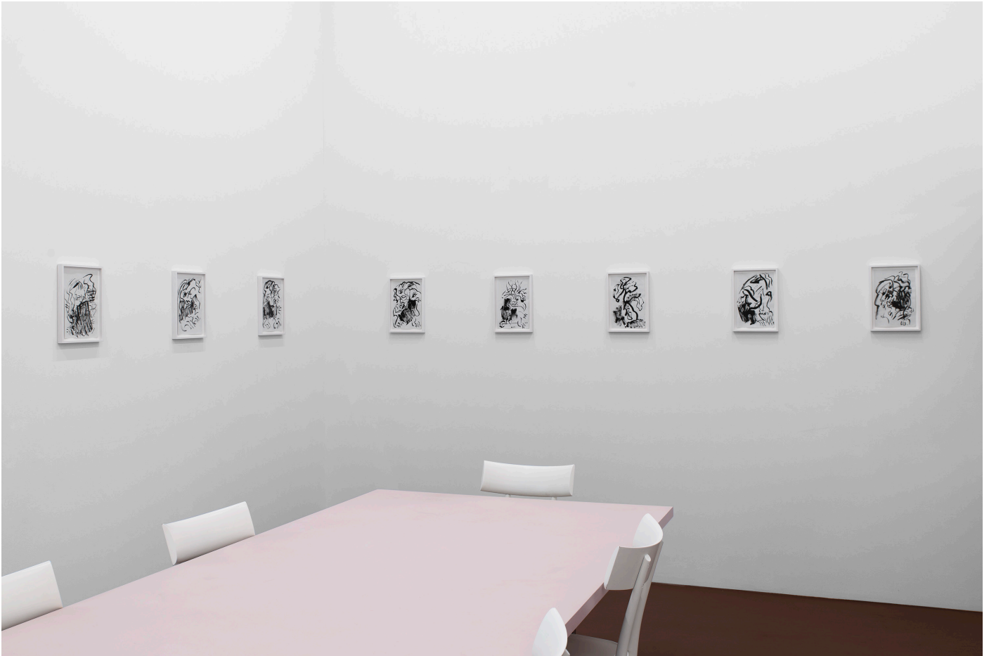
Models , 2020, Karma International, Zurich, Switzerland, exhibition view