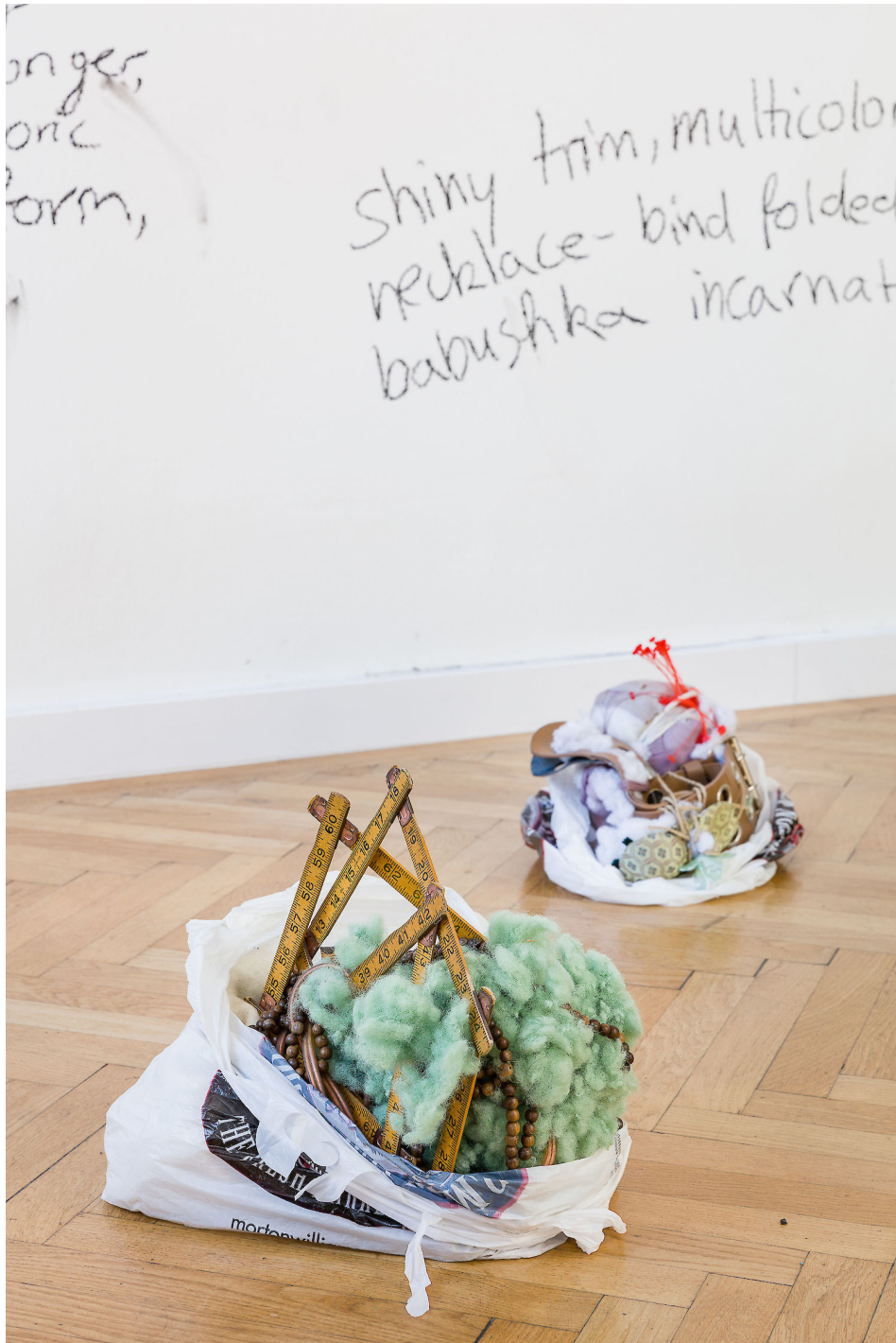
since the day i met you, 2017 Mixed media in plastic bag 30 x 35 x 28 cm (11.8 x 13.8 x 11 in.)