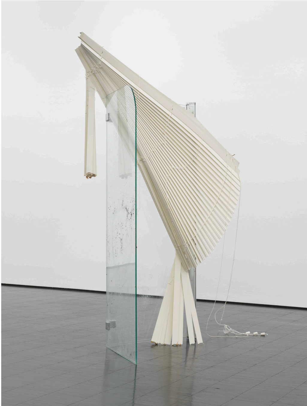
We Shall Survive in the Memory of Others , 2019, Galerie Barbara Weiss, Berlin, Germany, exhibition view