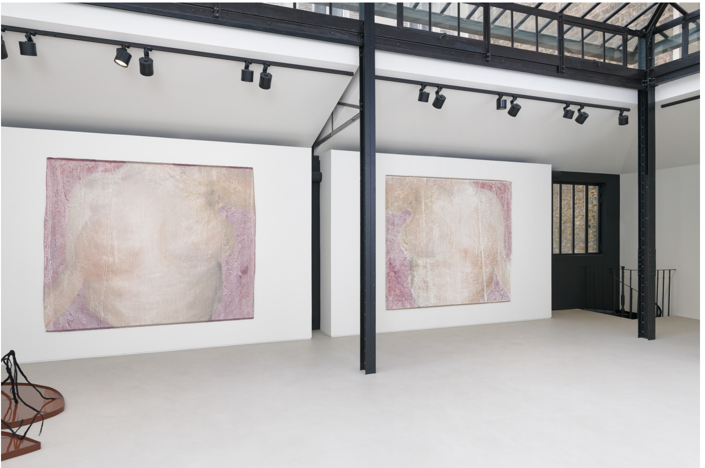
INFILTRÉES – 5 manières d'habiter le monde , Prix Reiffers Art Initiatives 2023, Accacias Art Center, Paris, France, exhibition view