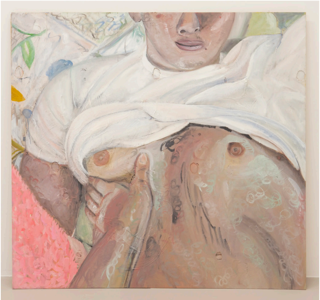
Untitled , 2018 Oil, acrylic and liquid latex on wood 121.92 x 121.92 cm (48 x 48 in.)