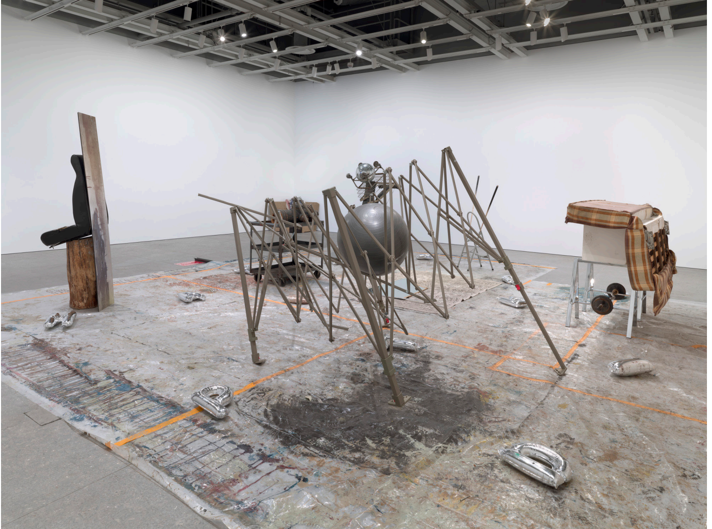
Whitney Biennial 2024: Even Better Than the Real Thing, 2024, Whitney Museum New York, USA, exhibition view