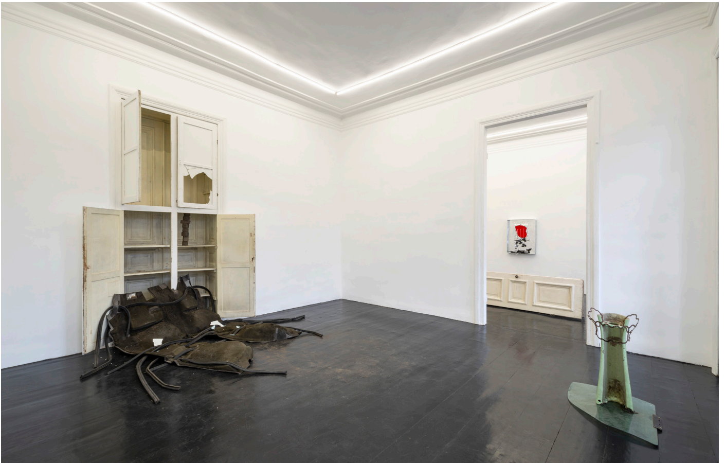
Stars are Blind , 2019, LC Queisser, Tbilisi, Georgia, exhibition view