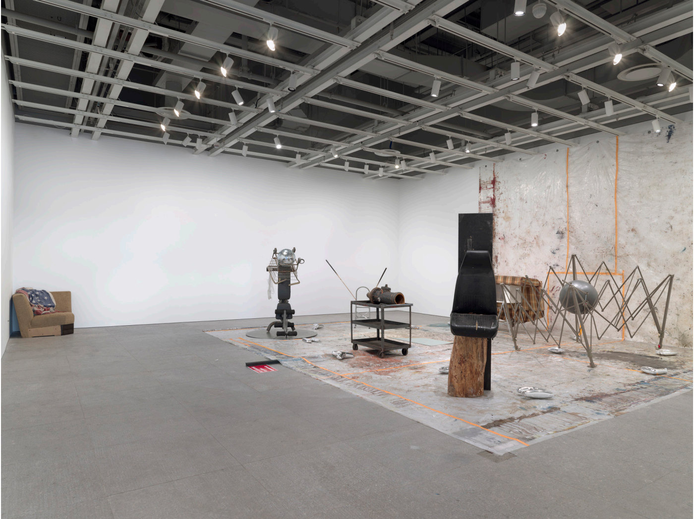
Whitney Biennial 2024: Even Better Than the Real Thing , 2024, Whitney Museum New York, USA, exhibition view