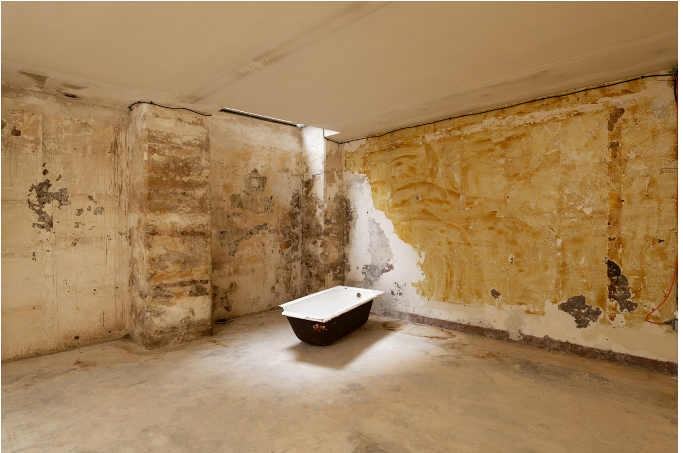
love time in vetivers, bathtub dropped a story and left as is, 2021 39 x 160 x 71 cm (15.4 x 63 x 27.9 in.)