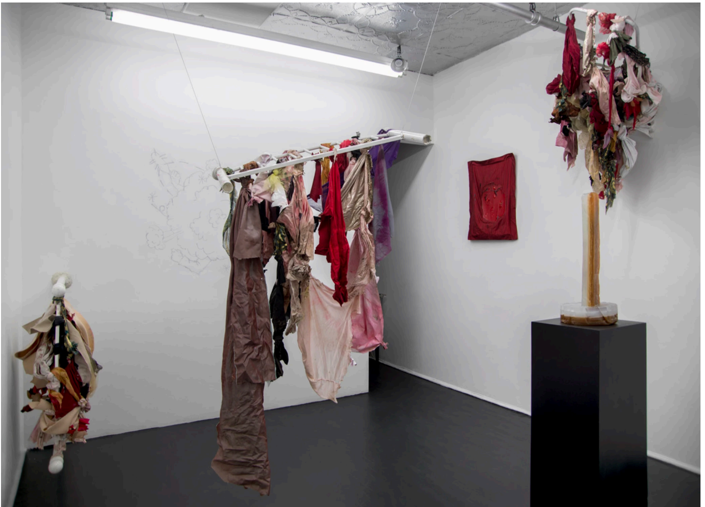
Bare teeth, 2018, Queer Thoughts, New York, USA, exhibition view