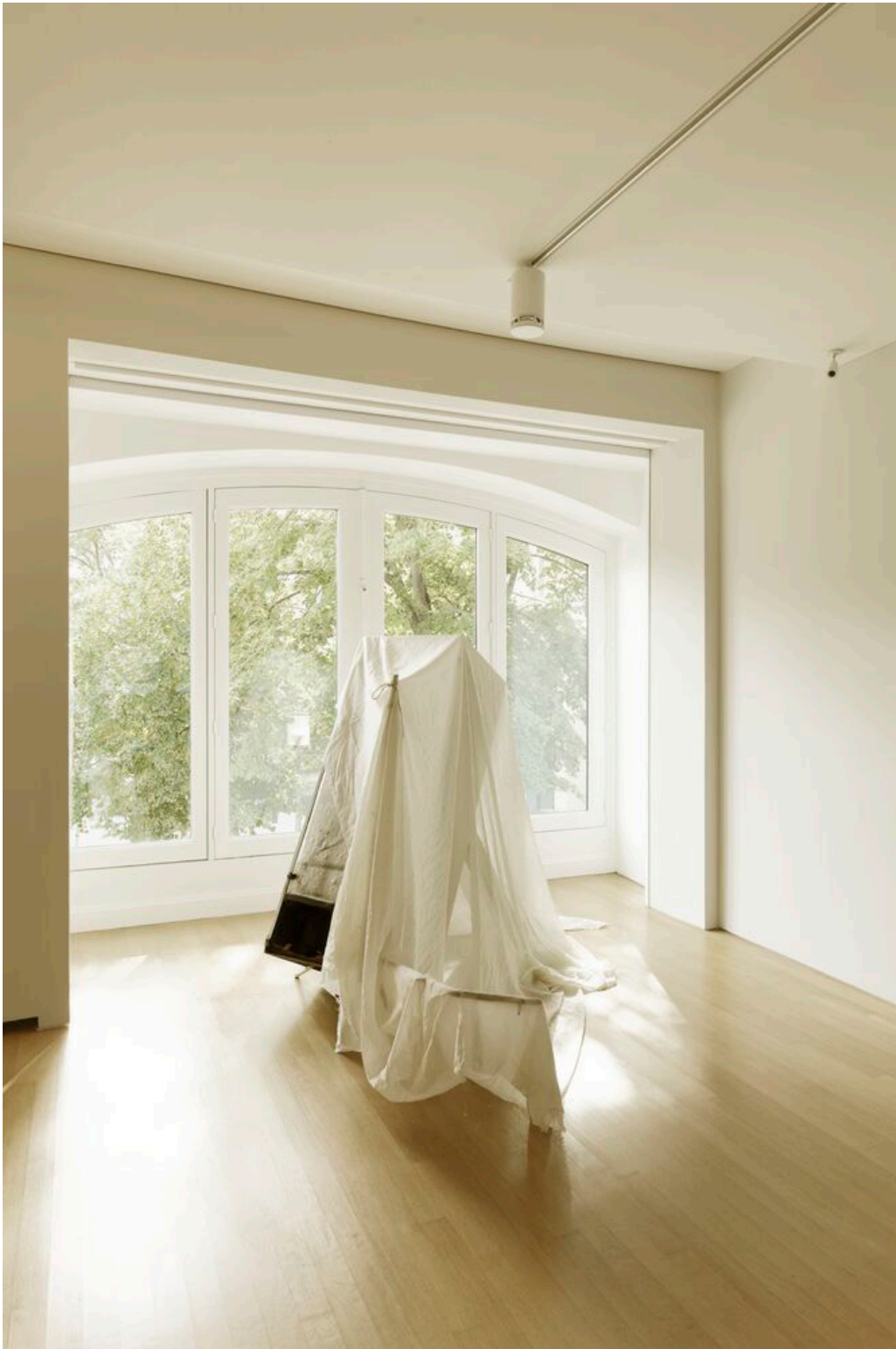
I fear (J'ai peur) , 2023, Bourse de Commerce - Pinault Collection, curated by Caroline Bourgeois, Paris, France, exhibition view