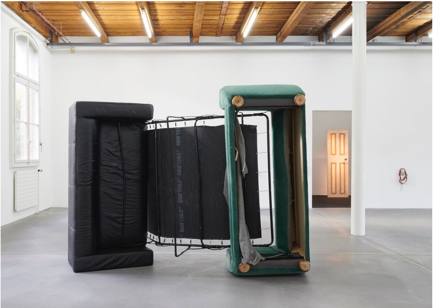
A House is not a Home , 2019, Fri Art, Kunsthalle Fribourg, Fribourg, exhibition view