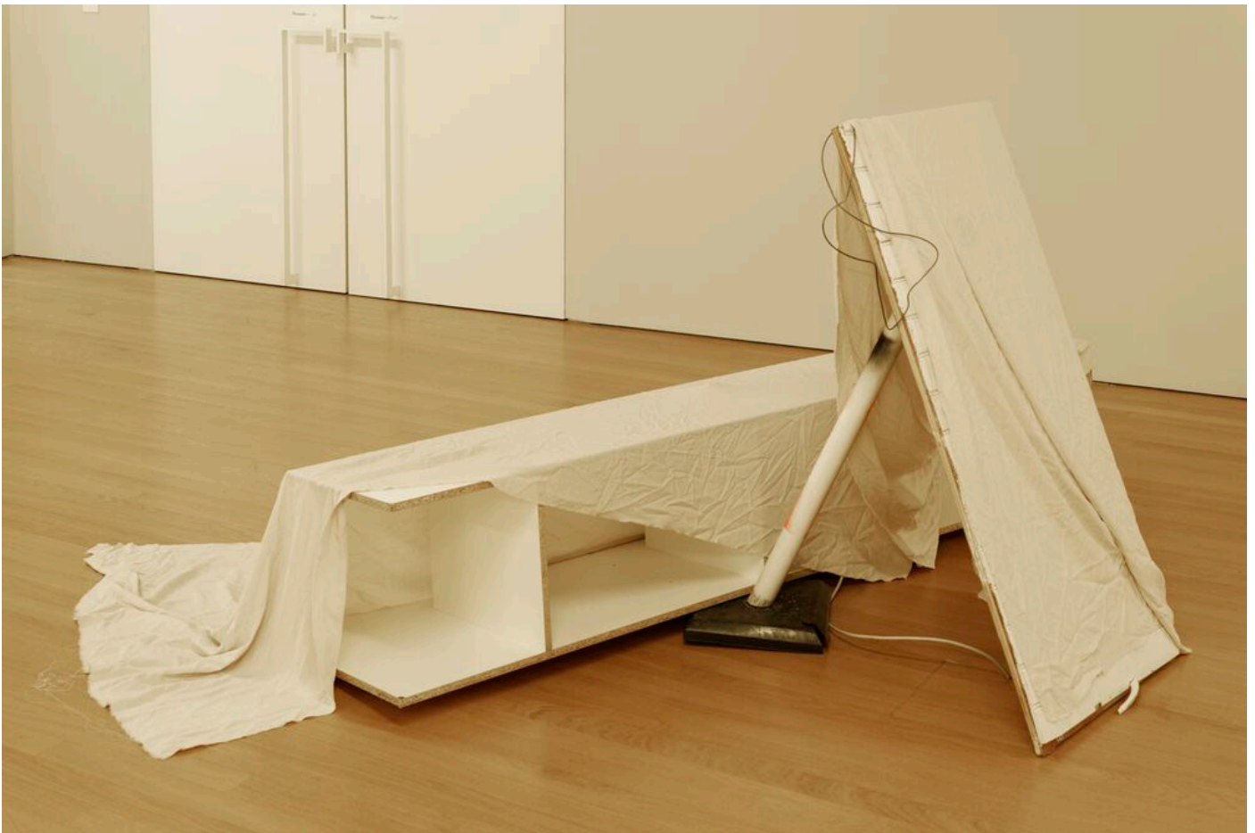
I fear (J'ai peur) , 2023; Bourse de Commerce - Pinault Collection, curated by Caroline Bourgeois, Paris, France, exhibition view