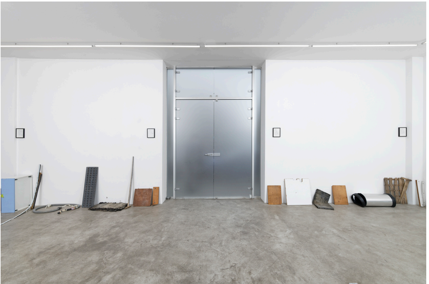
Ser Serpas , 2021, Balice Hertling, exhibition view