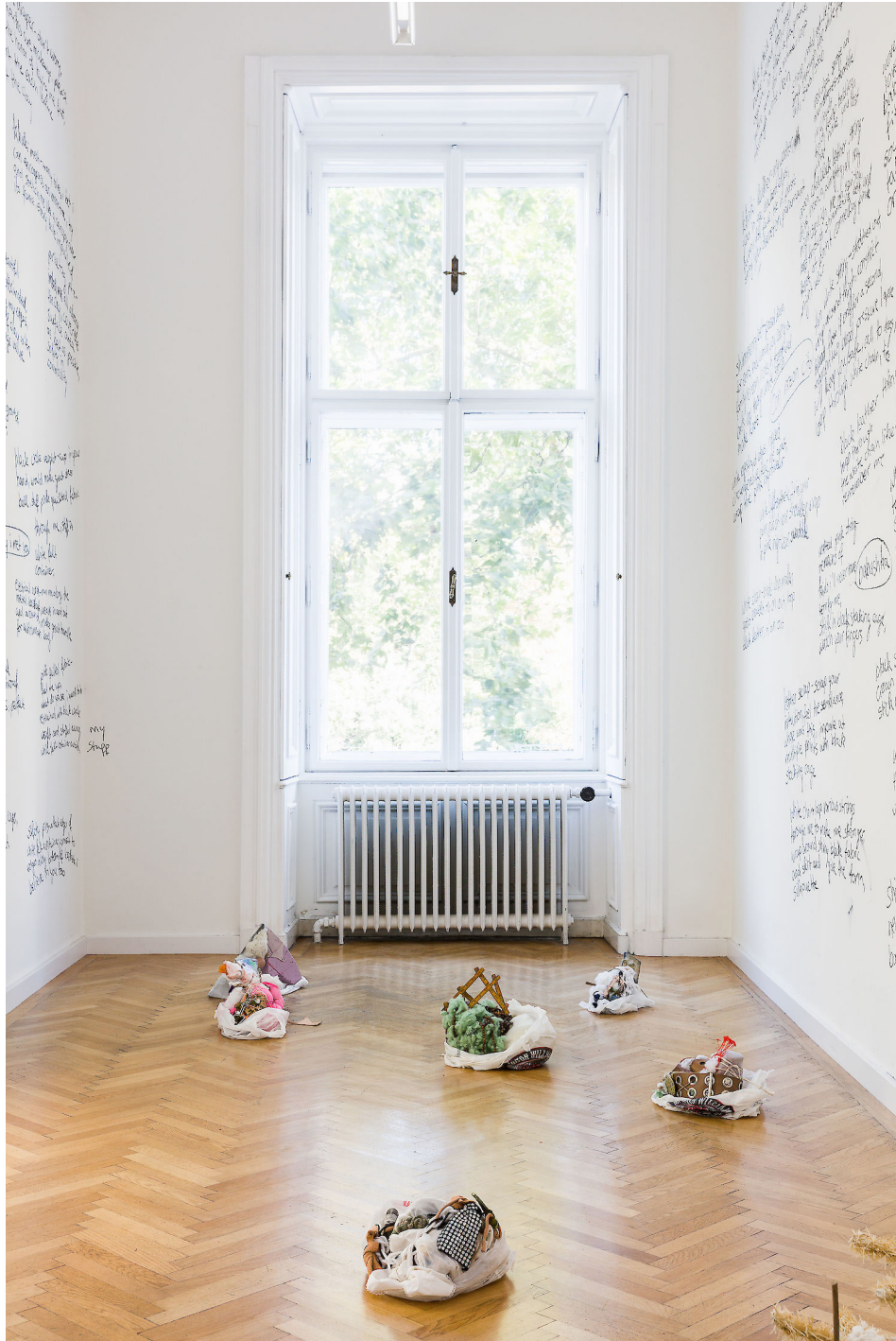
Kreislaufprobleme , 2019, Croy Nielsen, Vienna, Austria, exhibition view