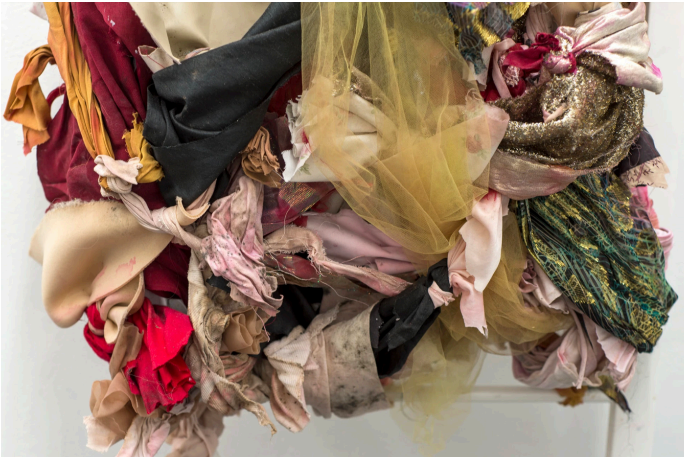
Bare teeth, 2018, Queer Thoughts, New York, USA, exhibition view