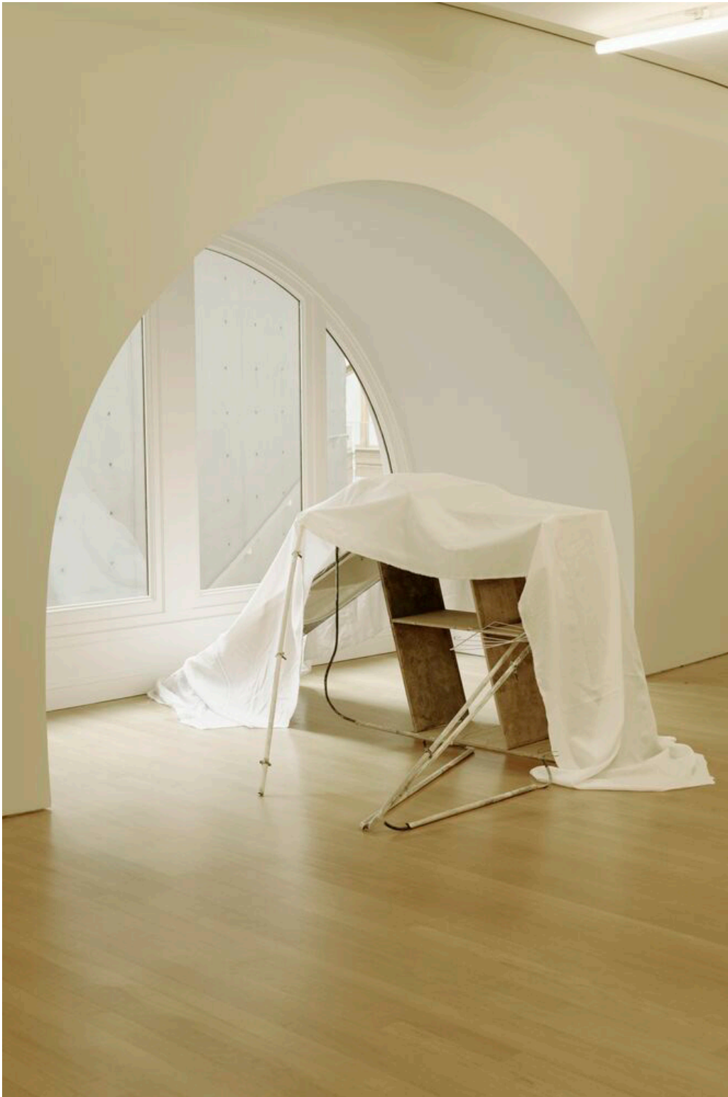
I fear (J'ai peur) , 2023, Bourse de Commerce - Pinault Collection, curated by Caroline Bourgeois, Paris, France, exhibition view