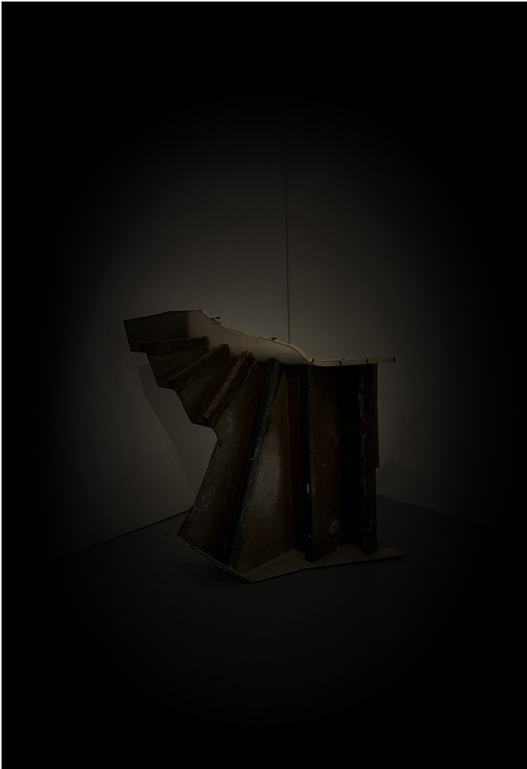
It Depends , 2024, Blank Canvas, Penang, Malaysia, exhibition view