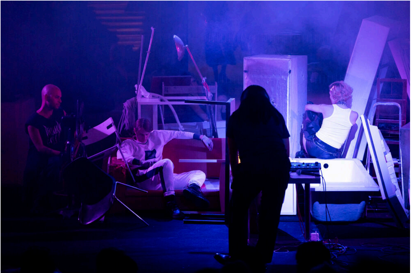
Basement Scene , 2024, Bourse de Commerce - Pinault Collection, Paris, France, performance