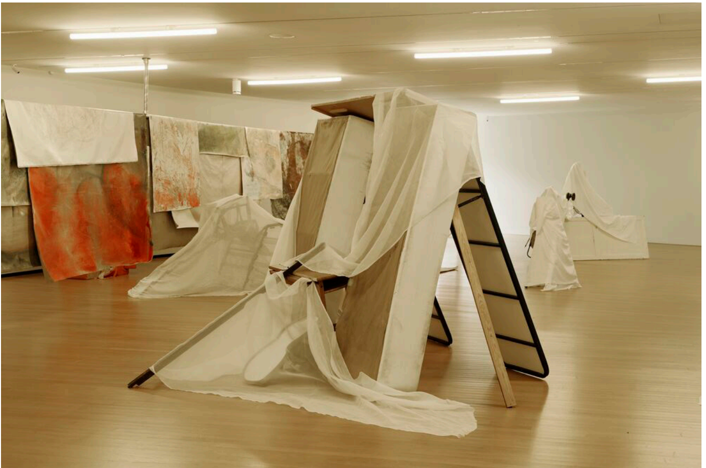
I fear (J'ai peur) , 2023, Bourse de Commerce - Pinault Collection, curated by Caroline Bourgeois, Paris, France, exhibition view