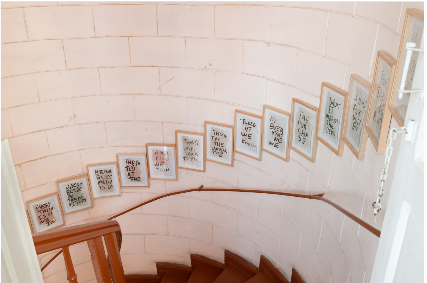
Guesthouse , 2021, LC Queisser, Tbilisi, Georgia, exhibition view