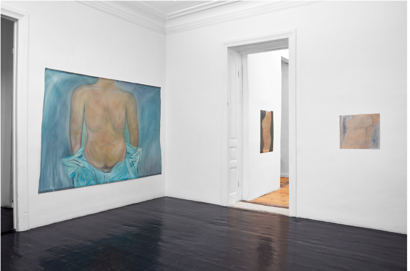
Monakhos , 2022, LC Queisser, Tbilisi, Georgia, exhibition view