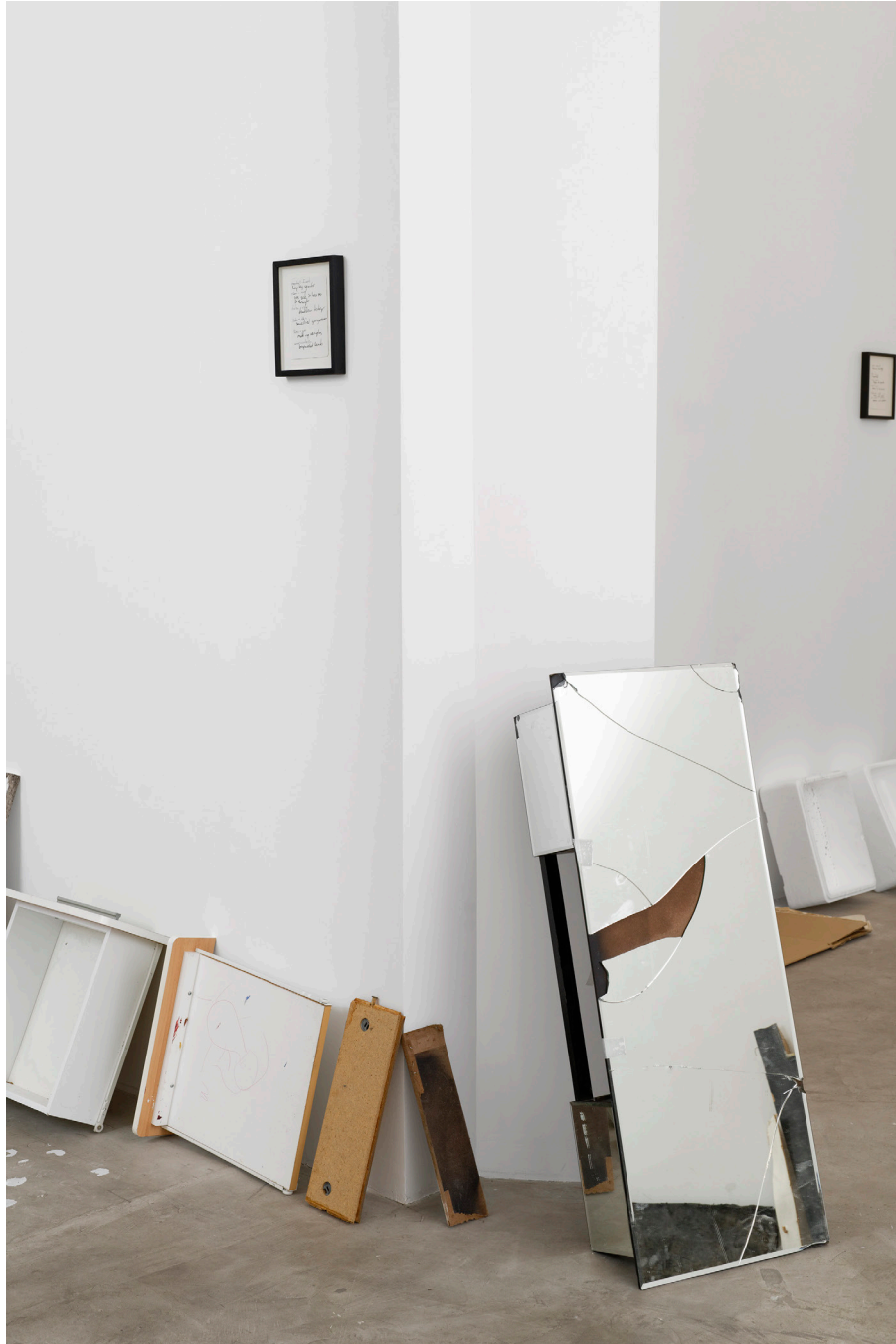
Ser Serpas , 2021, Balice Hertling, exhibition view