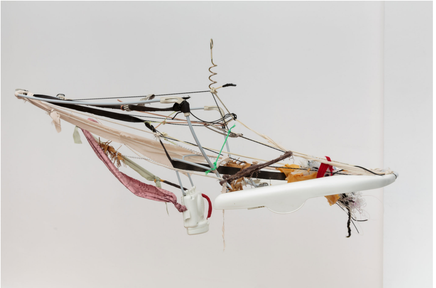
Notes on Entropy , 2020, Arcadia Missa, London, UK, exhibition view