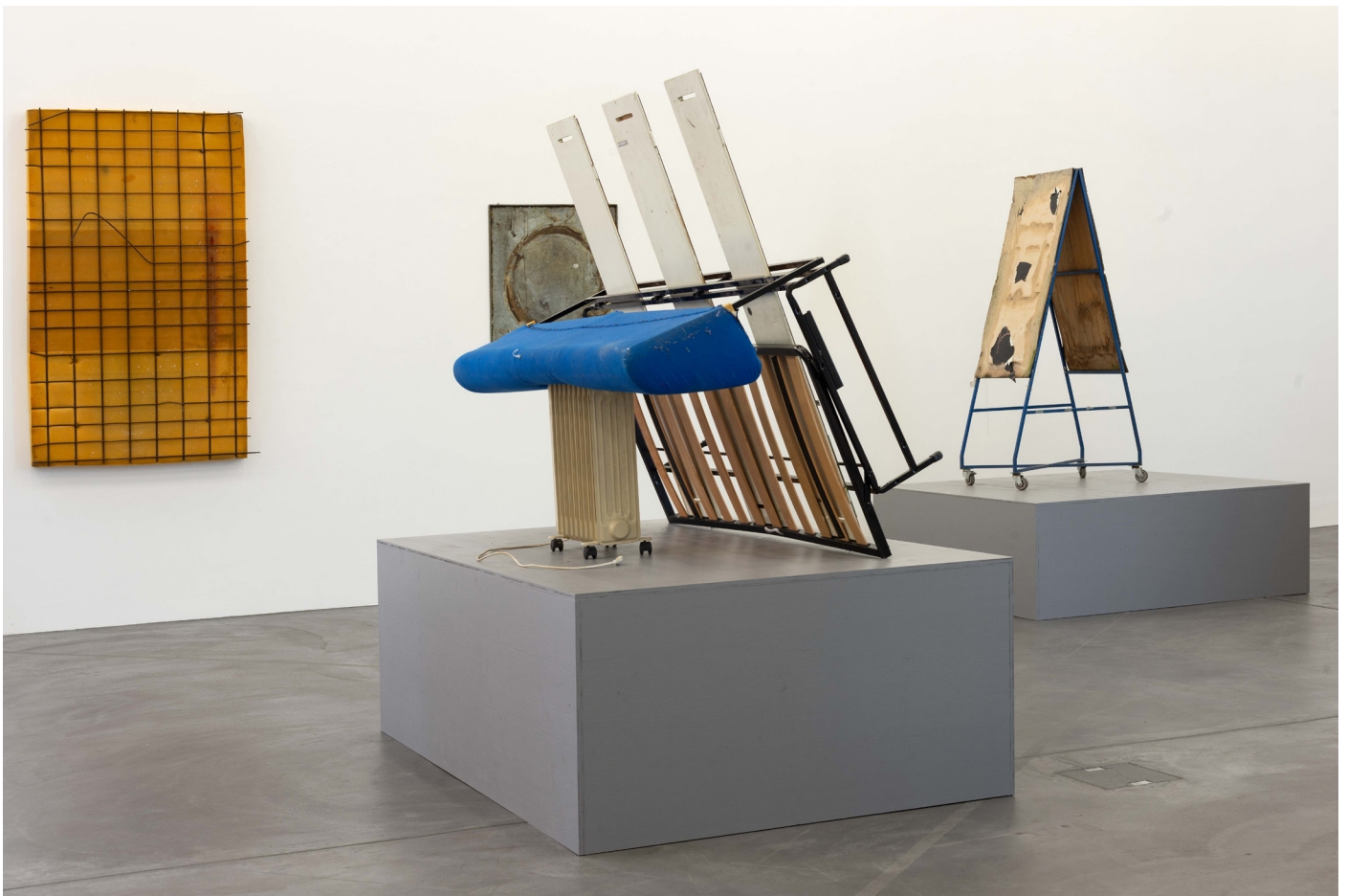
You were created to be so young (self-harm exercise) , 2018, Luma Westbau, Zürich, Switzerland, exhibition view