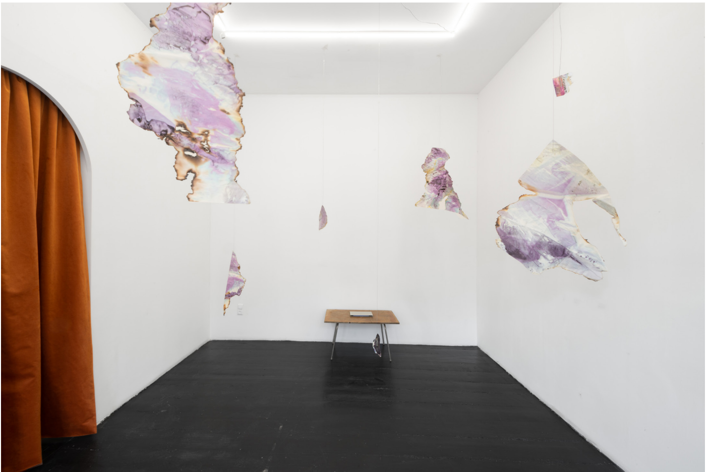
Guesthouse , 2021, LC Queisser, Tbilisi, Georgia, exhibition view