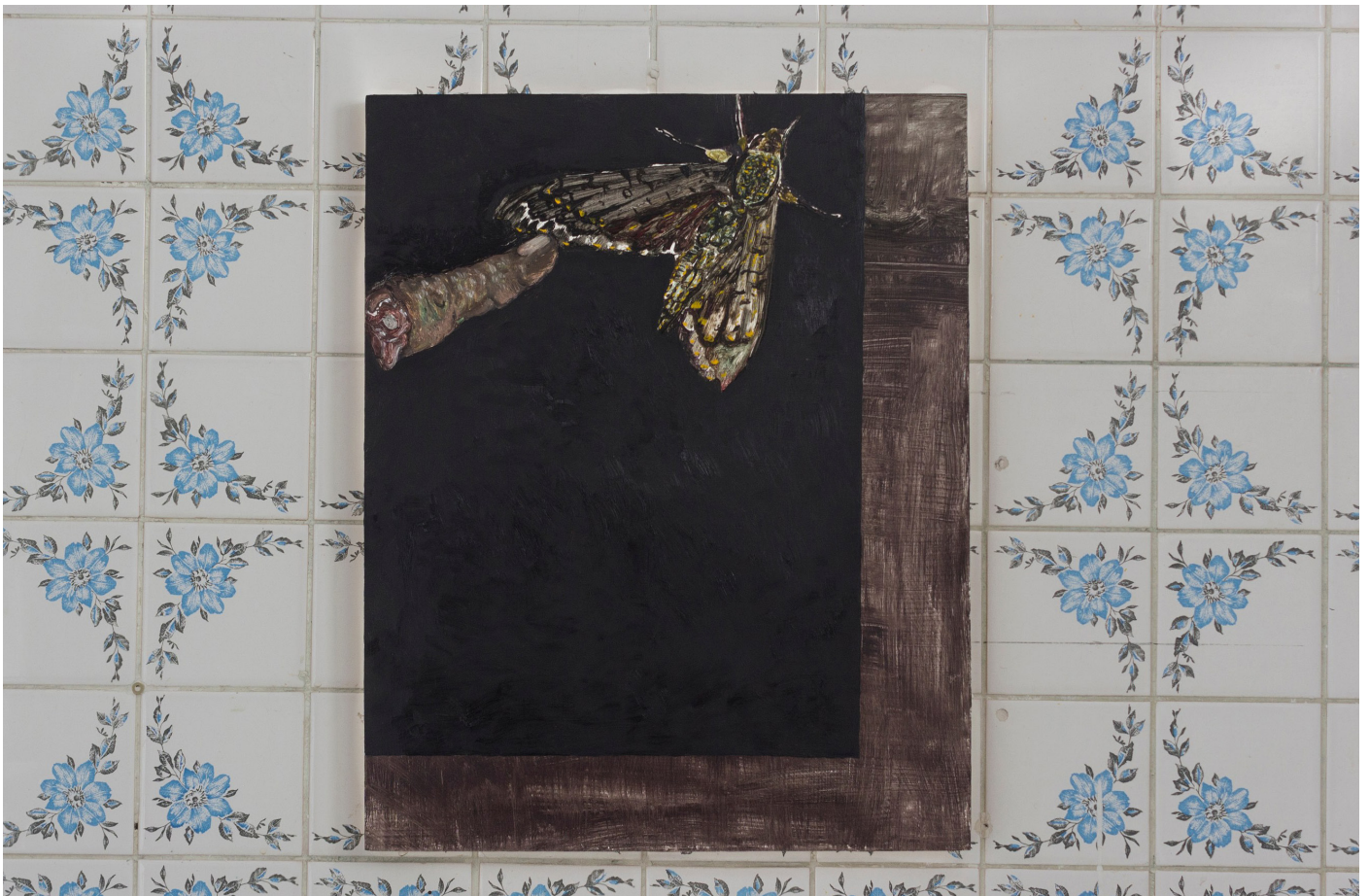
Enjoyed collectively, 2020 Oil on panel 50x40cm