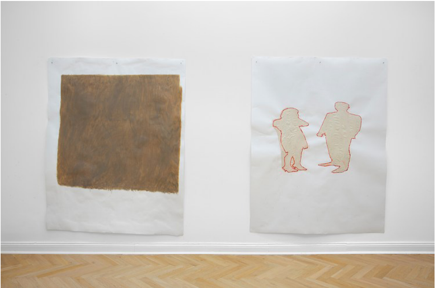
Hydra (or downtown) , 2024, Louche Ops, Berlin, exhibition view