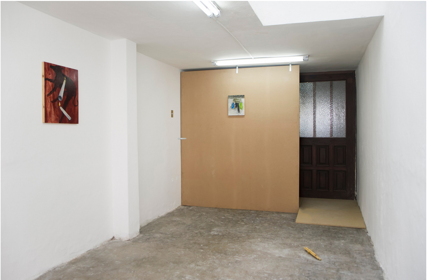
Errandt , 2021, Rudimento Quito, exhibition view