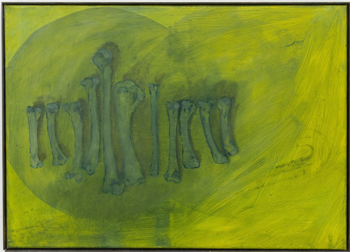
Tantalia , 2023 Oil on canvas 70x50 cm unique