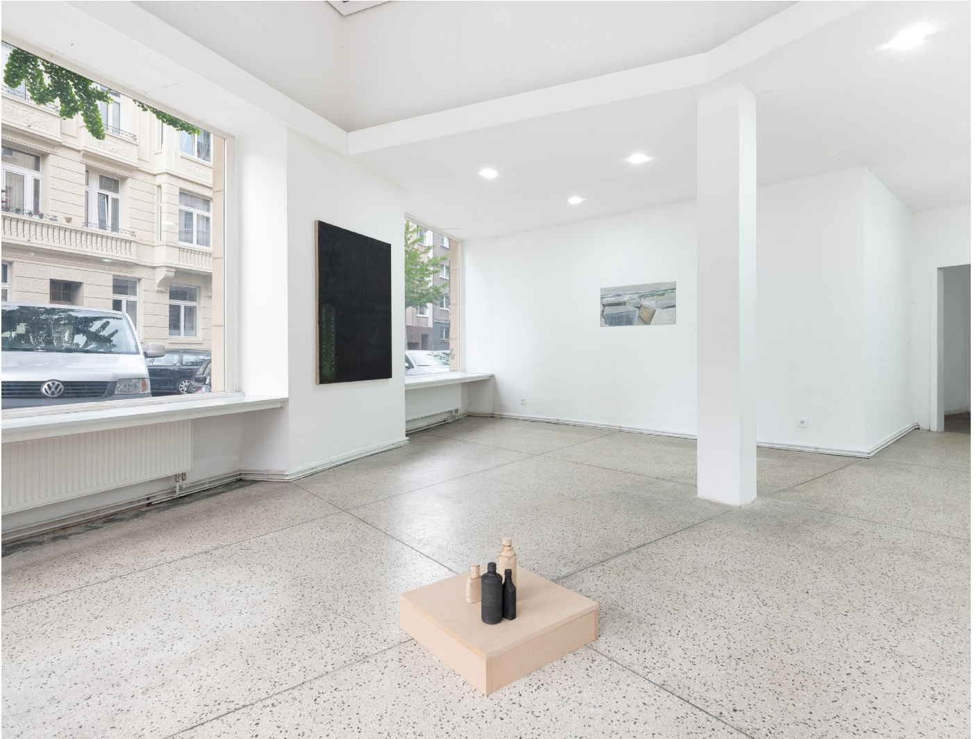
Flintlock , 2023, ECHO, Cologne, exhibition view