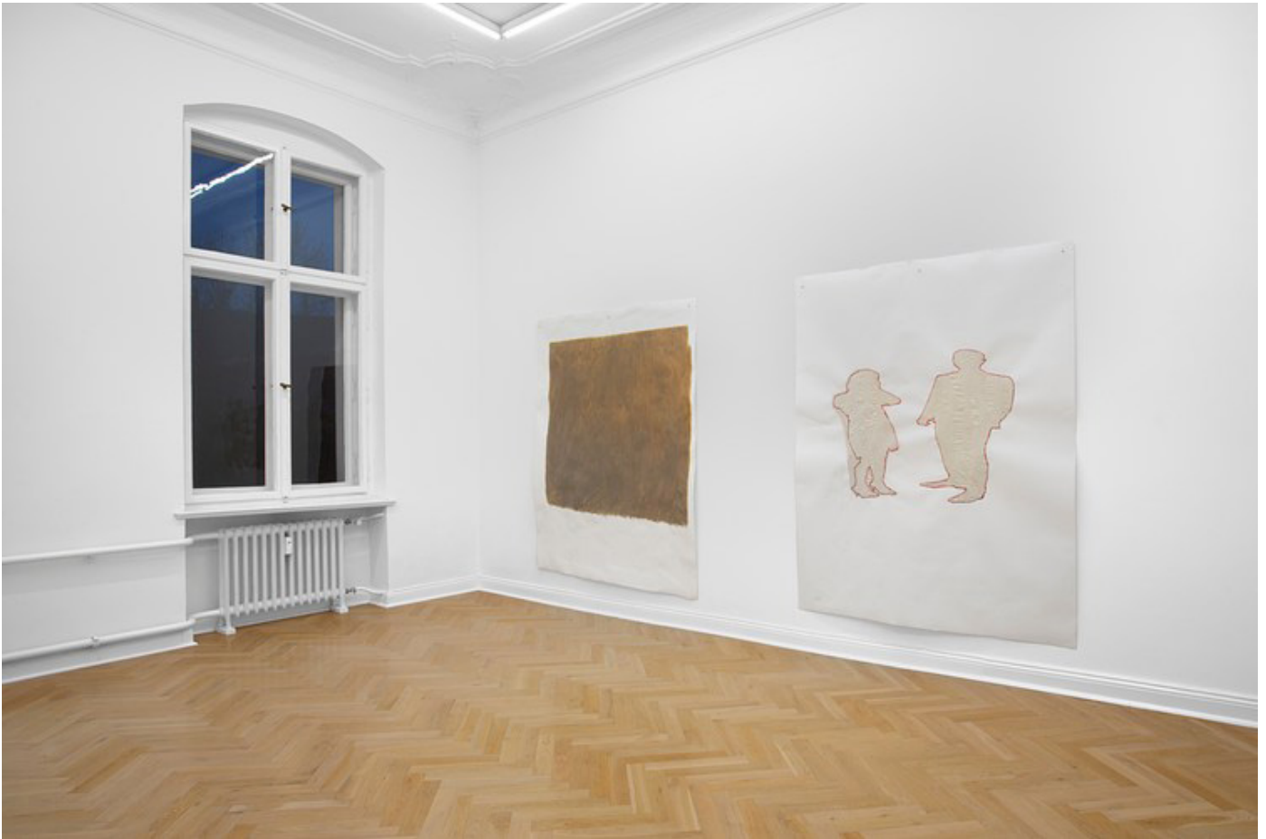
Hydra (or downtown) , 2024, Louche Ops, Berlin, exhibition view