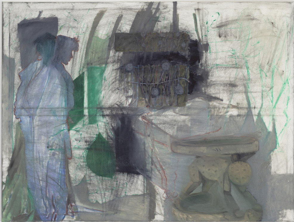
Untitled (figura con silla de madera) (with wooden figure), 2024 Oil on canvas 30 x 160 cm