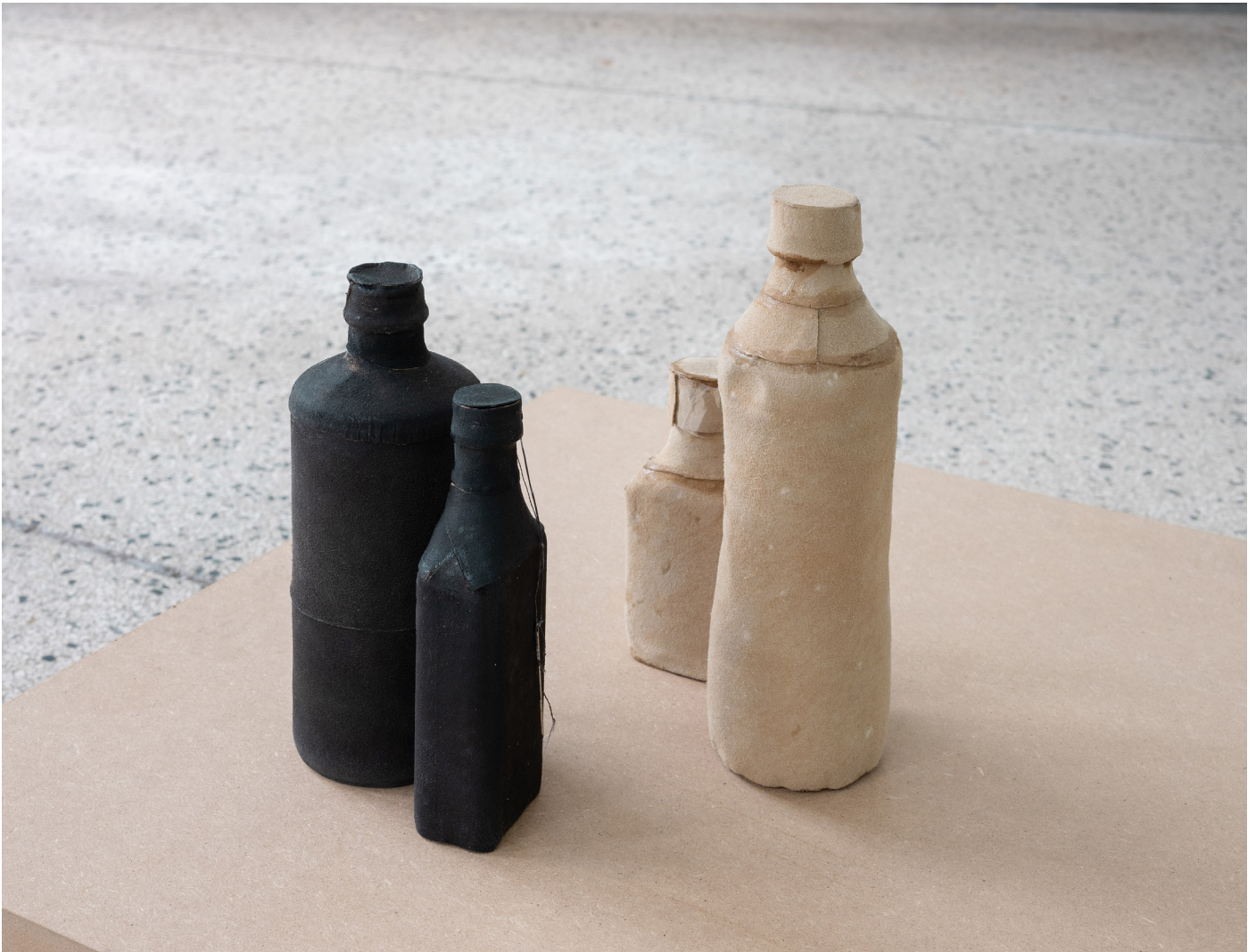
Hydra (or Downtown), 2023 Aniline goatskin, glass, plastic, mint liquor, dispersion glue 20 x 30 x 30 cm