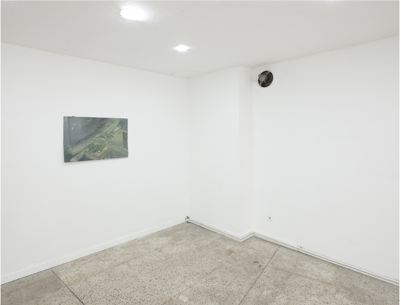
Flintlock , 2023, ECHO, Cologne, exhibition view