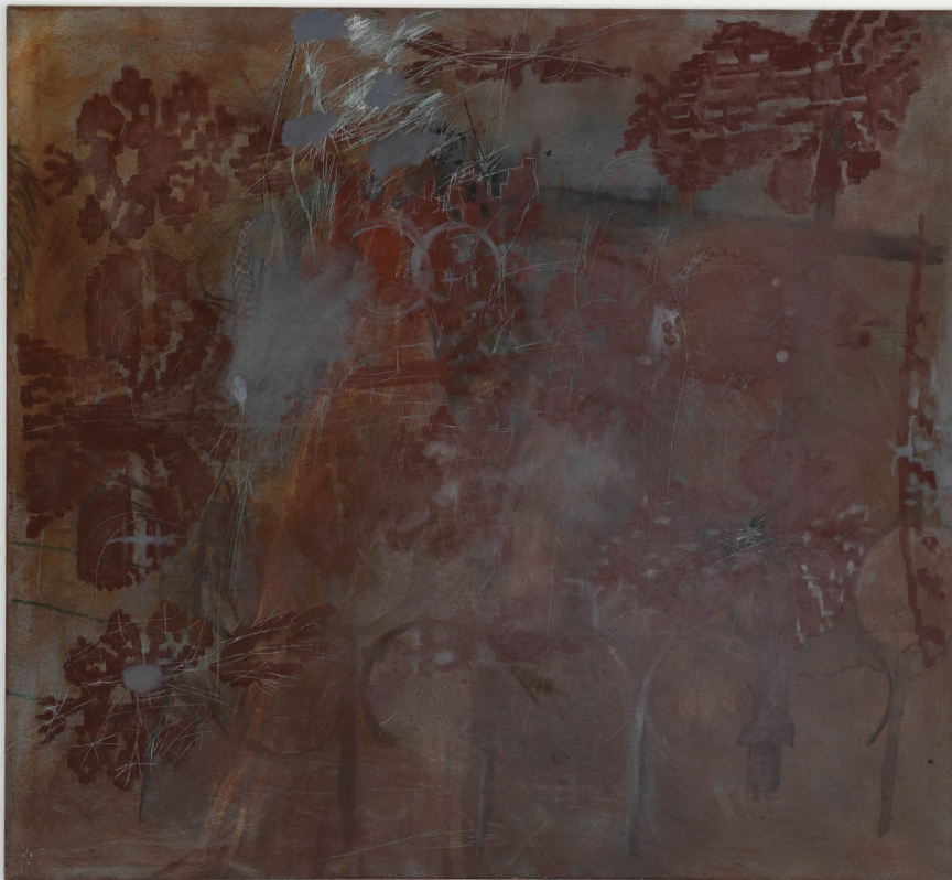
Untitled (with beaded bracelet), 2024 Oil, ink, graphite on canvas 110 x 120 cm