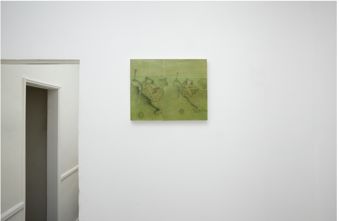
Glower , 2022, Larder, Los Angeles, exhibition view