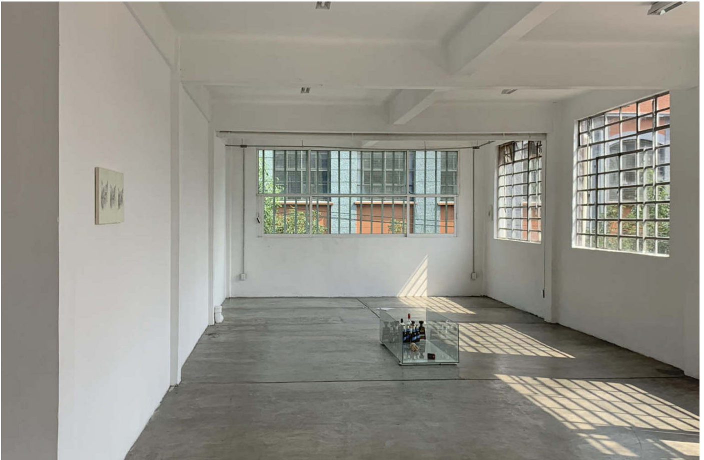
Babies born without brains , 2019, collaboration with Isabelle Frances McGuire, LAGOS, CDMX, exhibition view