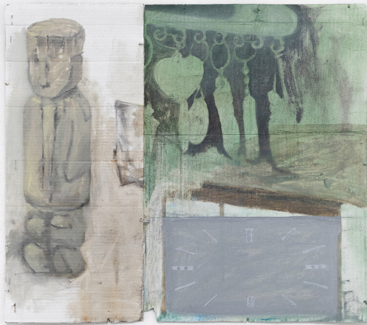
Untitled (carved), 2023 Oil on cardboard 50 x 60 cm