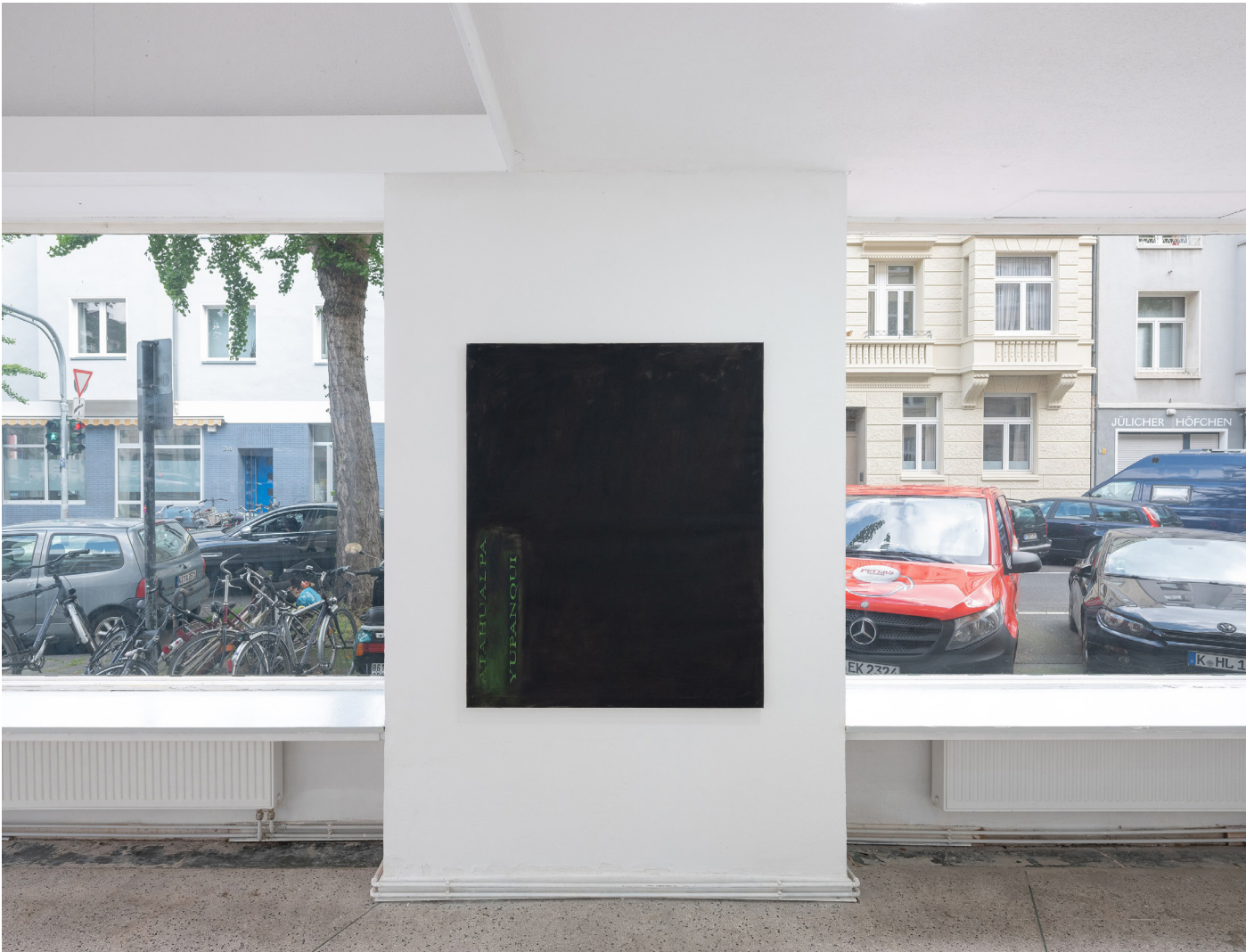
Flintlock , 2023, ECHO, Cologne, exhibition view