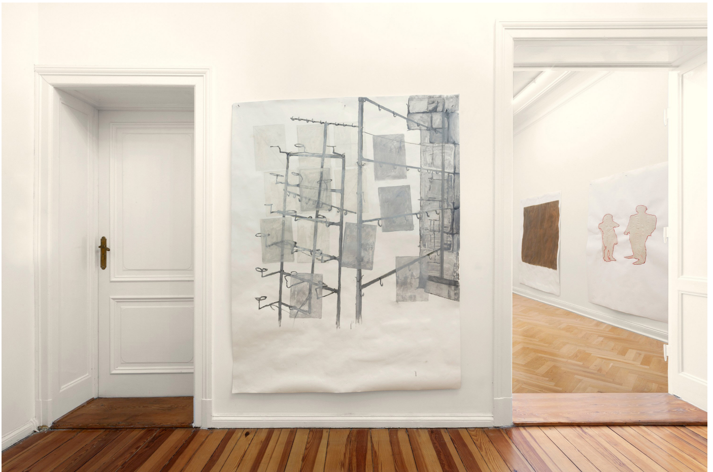
Hydra (or downtown) , 2024, Louche Ops, Berlin, exhibition view