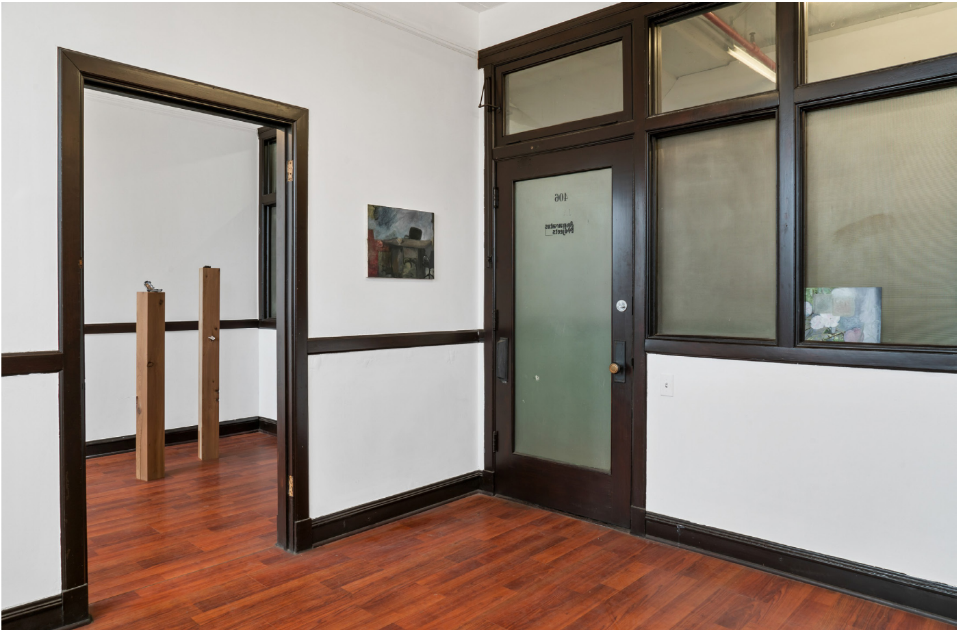
Maw , 2022, Elena Ailes, Antonio López, Apparatus Projects, Chicago, exhibition view