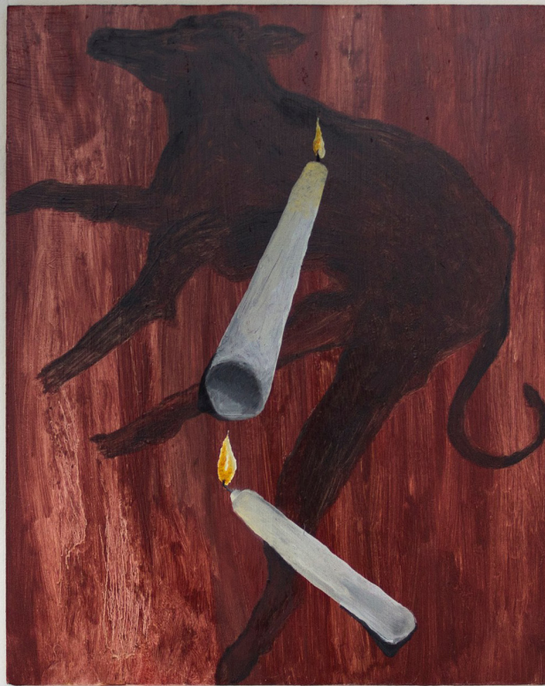
A , 2020 Oil on panel 50x40cm