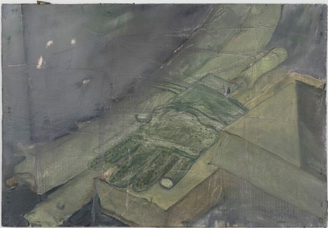
Flintlock , 2023 Oil and staples on cardboard 60 x 80 cm