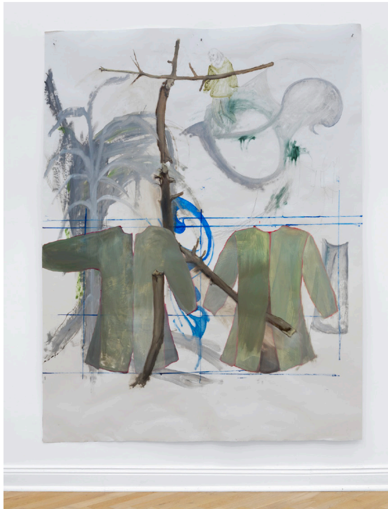
Hydra (or downtown) , 2024 Oil on treated paper 150 x 196 cm