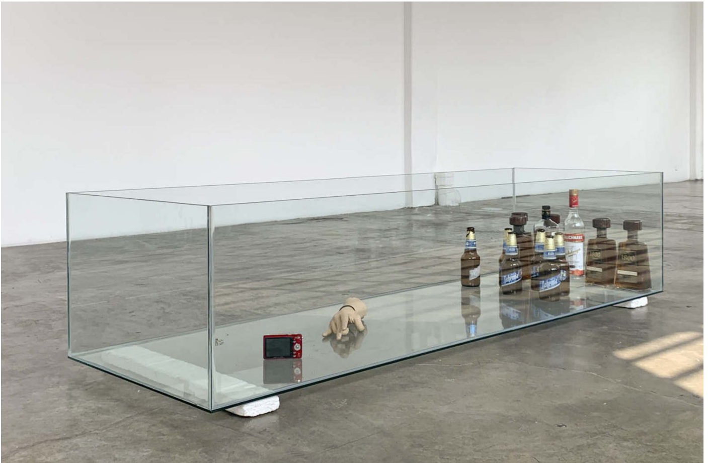
Babies born without brains , 2019, collaboration with Isabelle Frances McGuire, LAGOS, CDMX, exhibition view