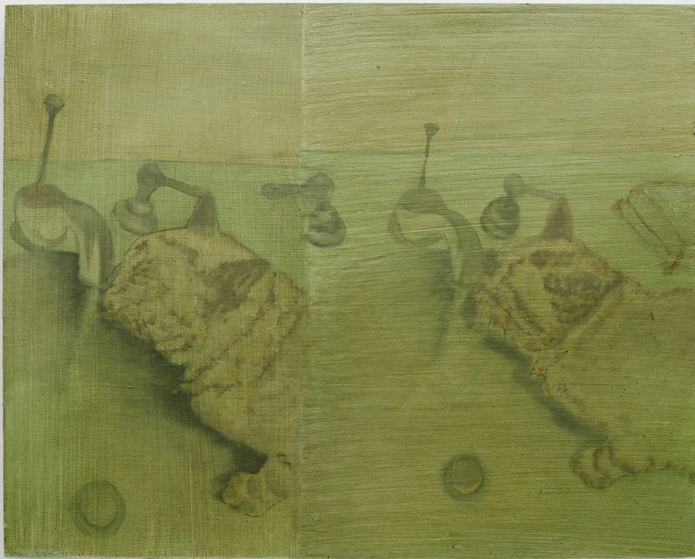
Cat/running water , 2022 Oil on panel 40 x 50 cm