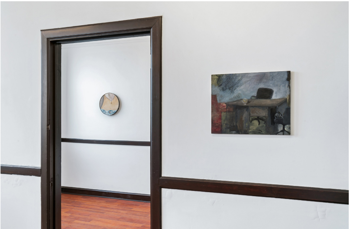
Maw , 2022, Elena Ailes, Antonio López, Apparatus Projects, Chicago, exhibition view