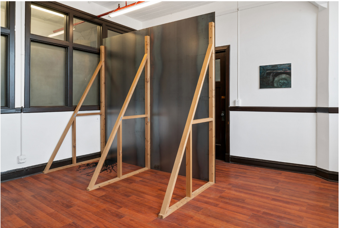
Maw , 2022, Elena Ailes, Antonio López, Apparatus Projects, Chicago, exhibition view