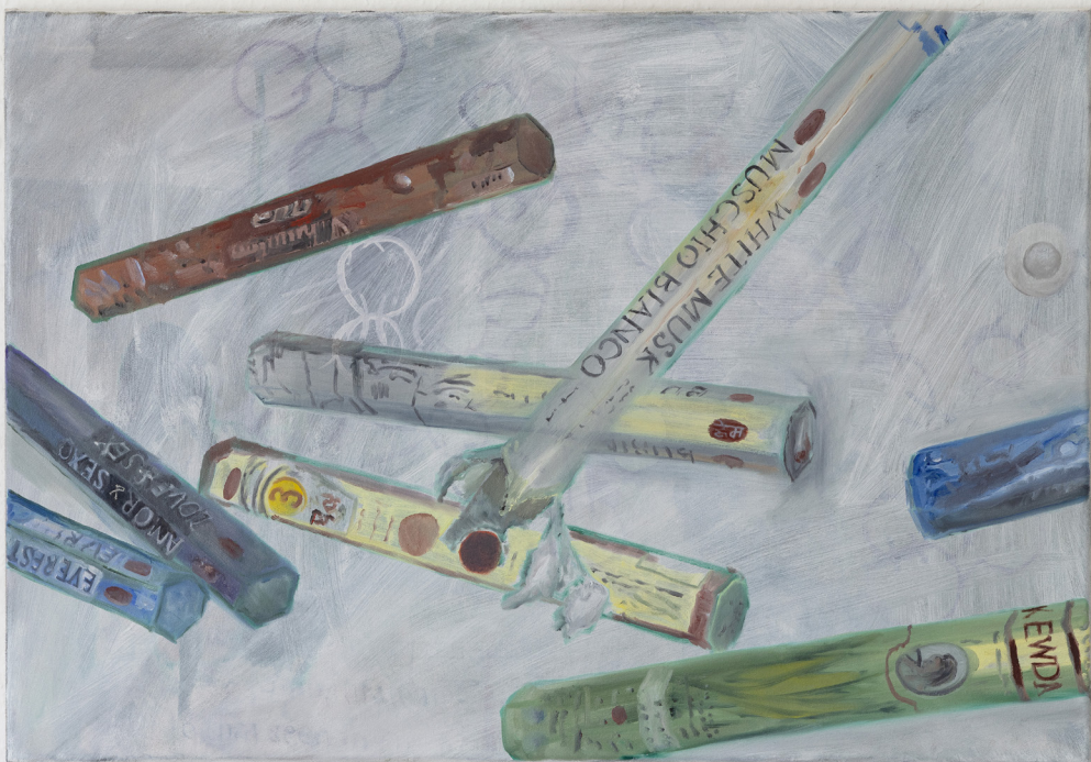
HEM incense sticks assorted: UNLOCK/ DESTRANCADERA, EVEREST, 3x1, WHITE MUSK, AMOR & SEXO, KEWDA, BUSINESS, 2024