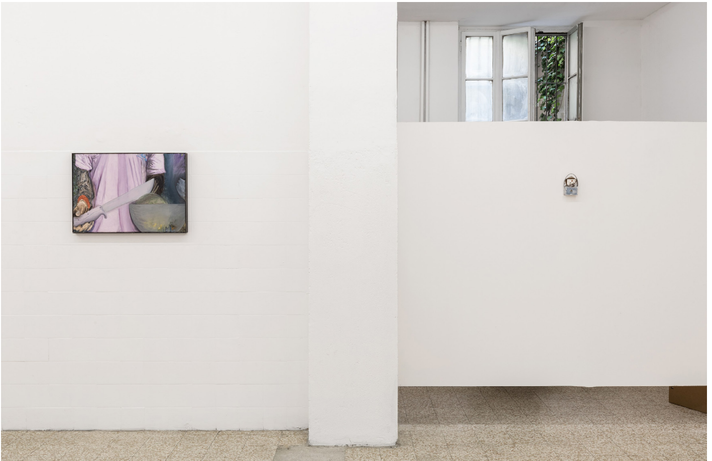
For Mummy , 2023, zaza', Milan, exhibition view