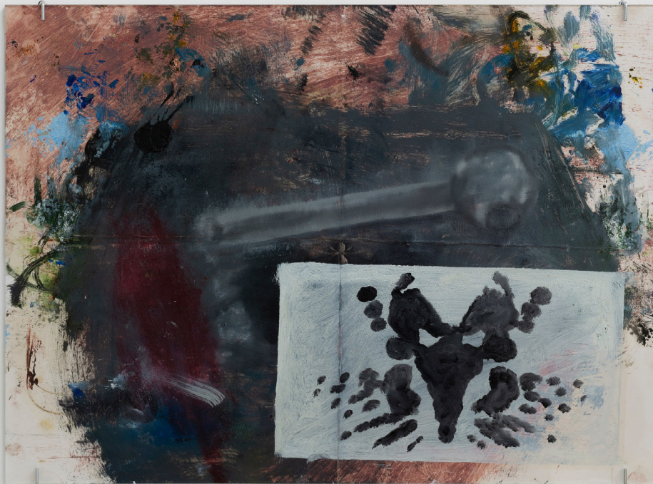
Untitled (crackpipe) 2023 oil on paper, between glass 29.5 x 40 cm