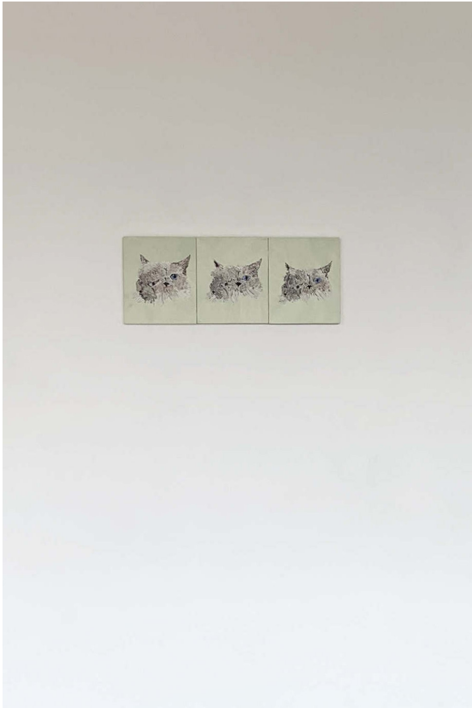
Babies born without brains , 2019, collaboration with Isabelle Frances McGuire, LAGOS, CDMX, exhibition view