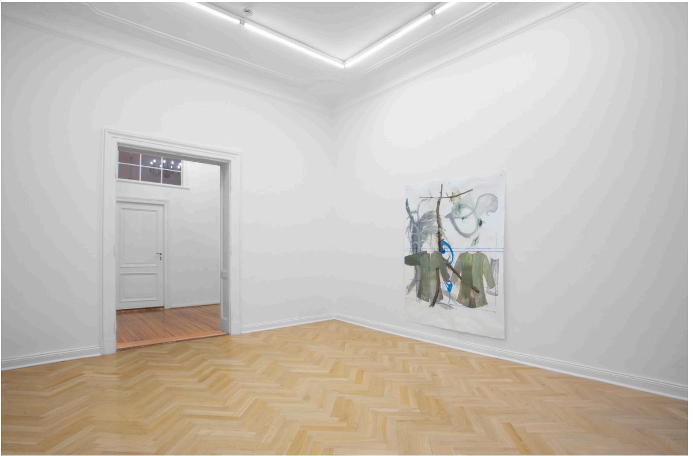
Hydra (or downtown) , 2024, Louche Ops, Berlin, exhibition view