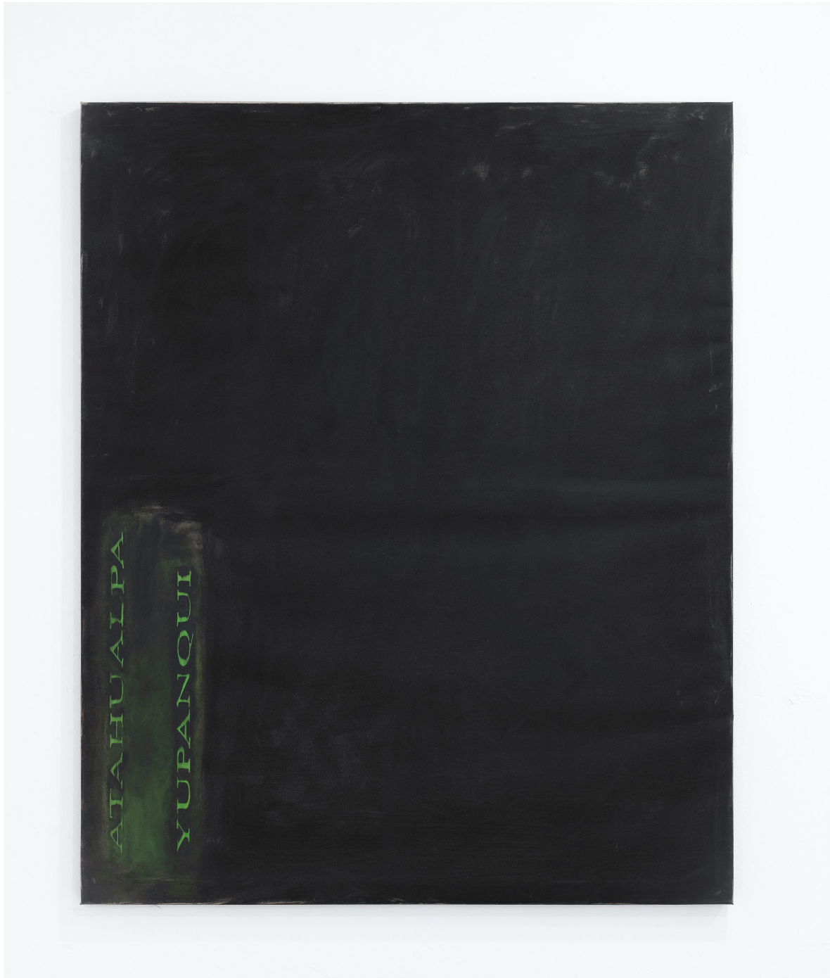
Untitled (green, black), 2023 Oil on canvas 135 x 110 cm