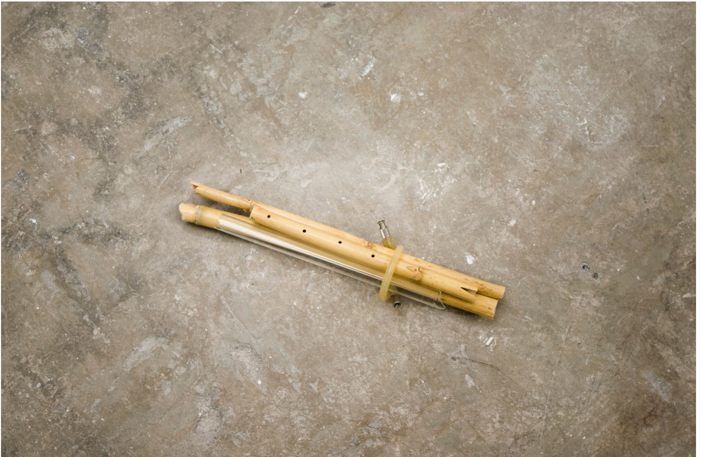
Pánicos 2021 Reed stems, surgical equip. wash tube, glass 30x13x10 cm