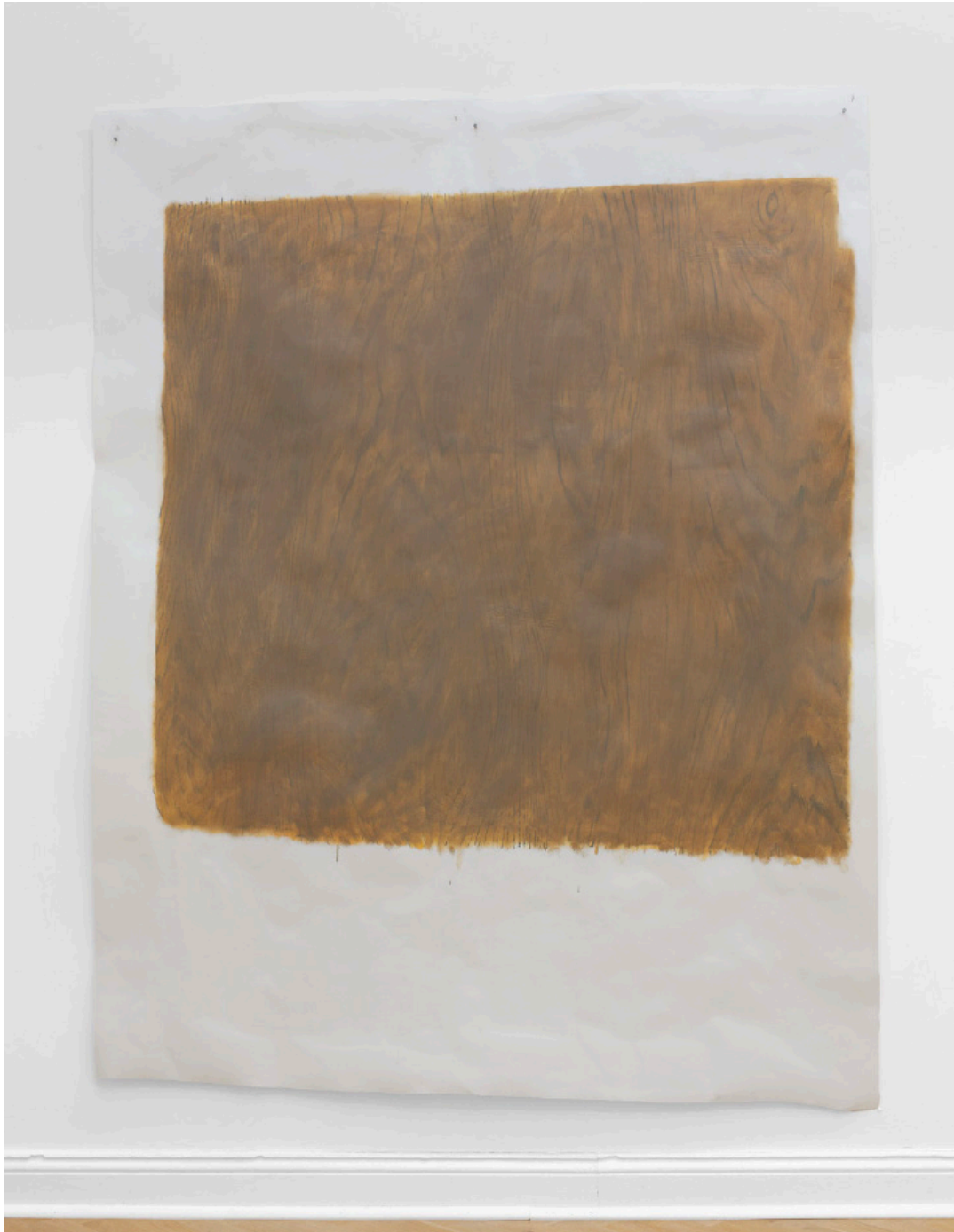
Cherry , 2024 Oil on treated paper 150 x 196 cm 59 x 77 1/8 in