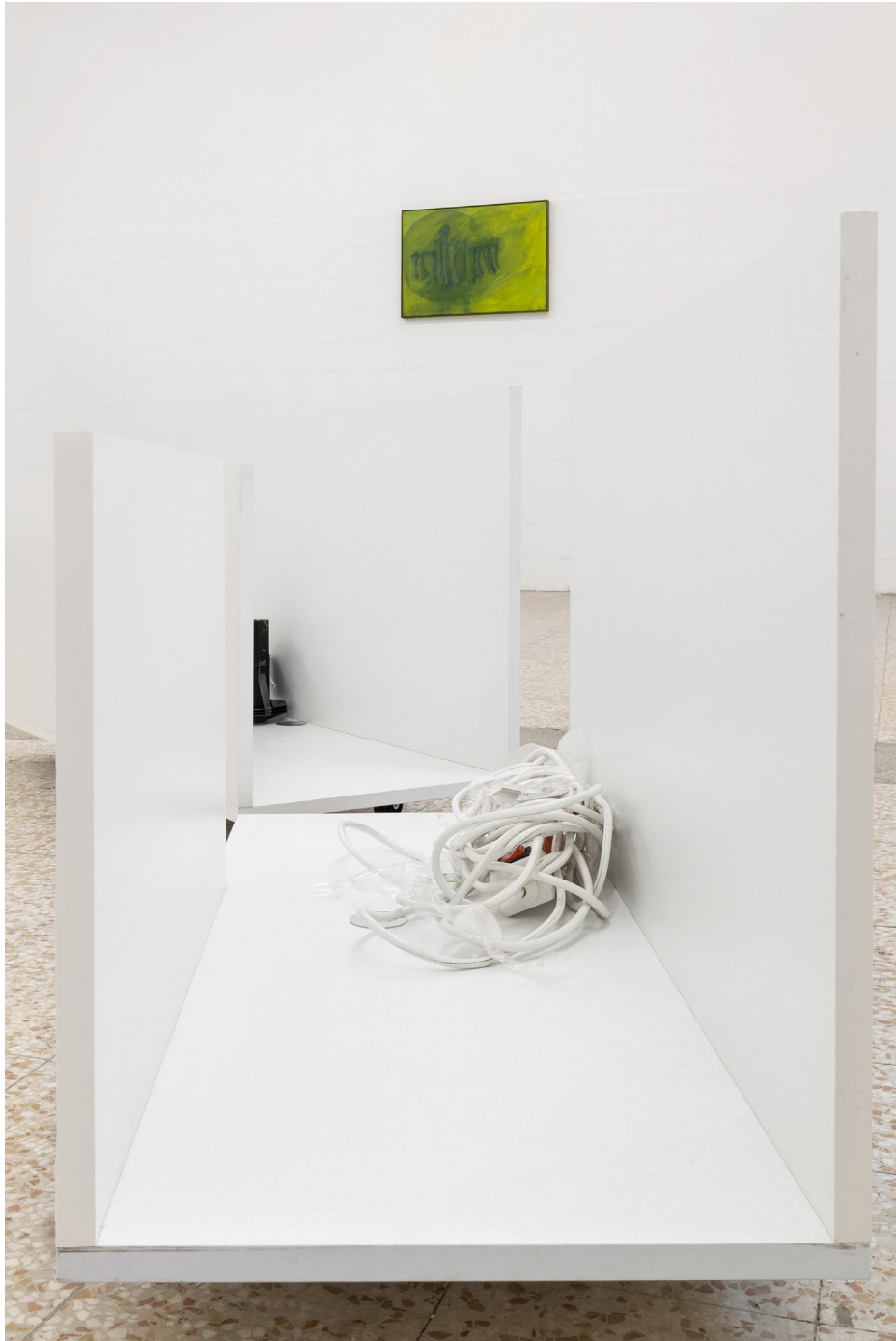
For Mummy , 2023, zaza', Milan, exhibition view