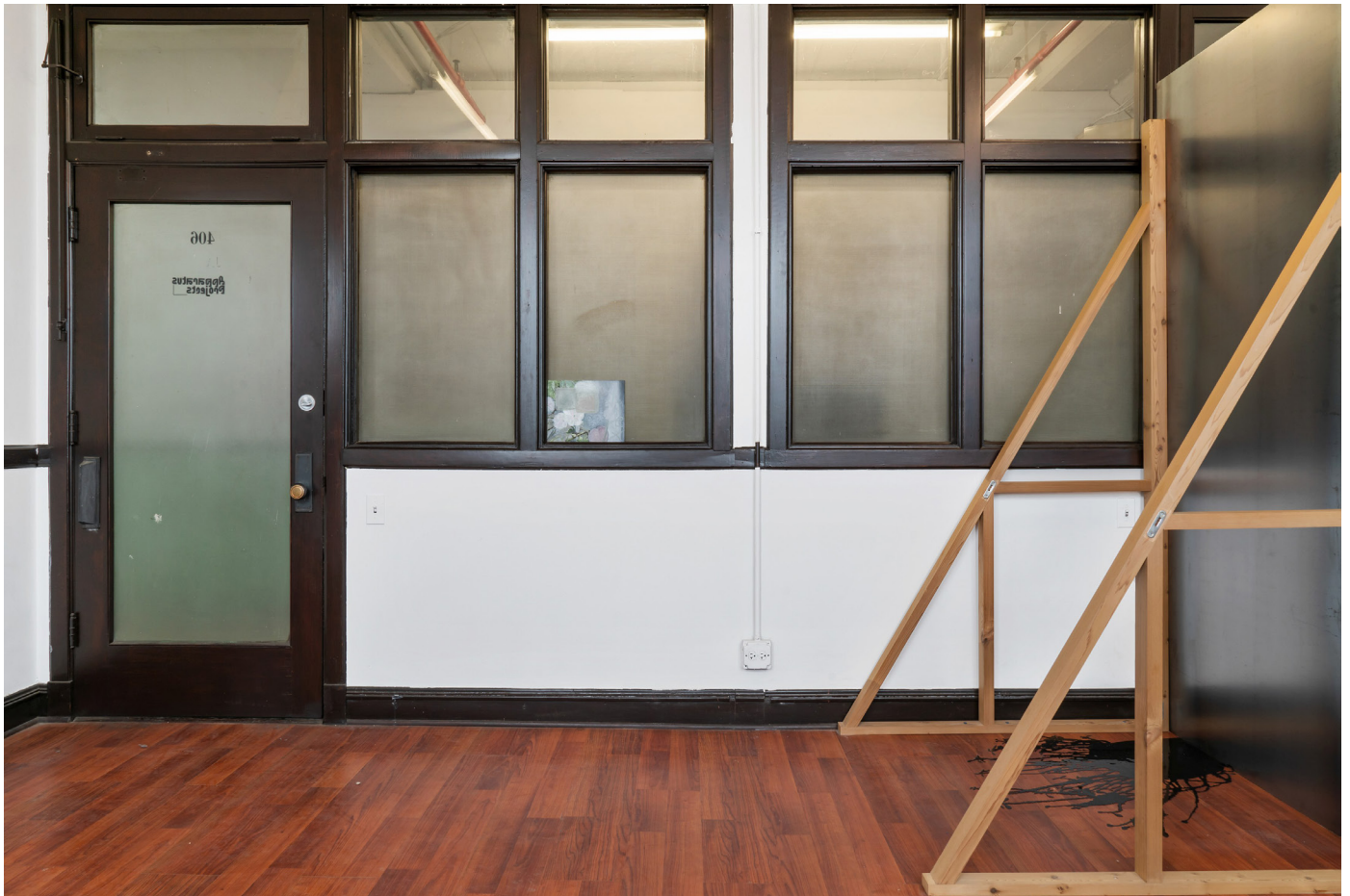
Maw , 2022, Elena Ailes, Antonio López, Apparatus Projects, Chicago, exhibition view