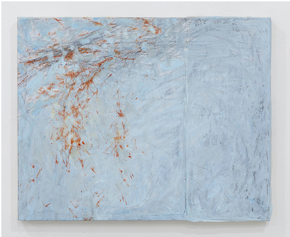
Aún sin titular , 2022 Oil graphite and ink on vellum on canvas mounted on panel 50 x 40 cm