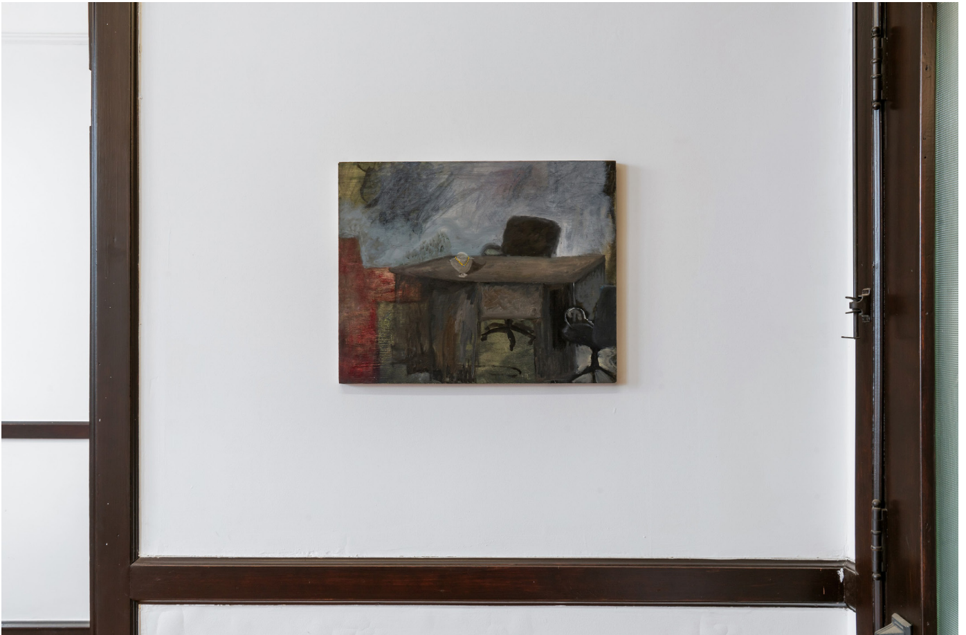
Maw , 2022, Elena Ailes, Antonio López, Apparatus Projects, Chicago, exhibition view