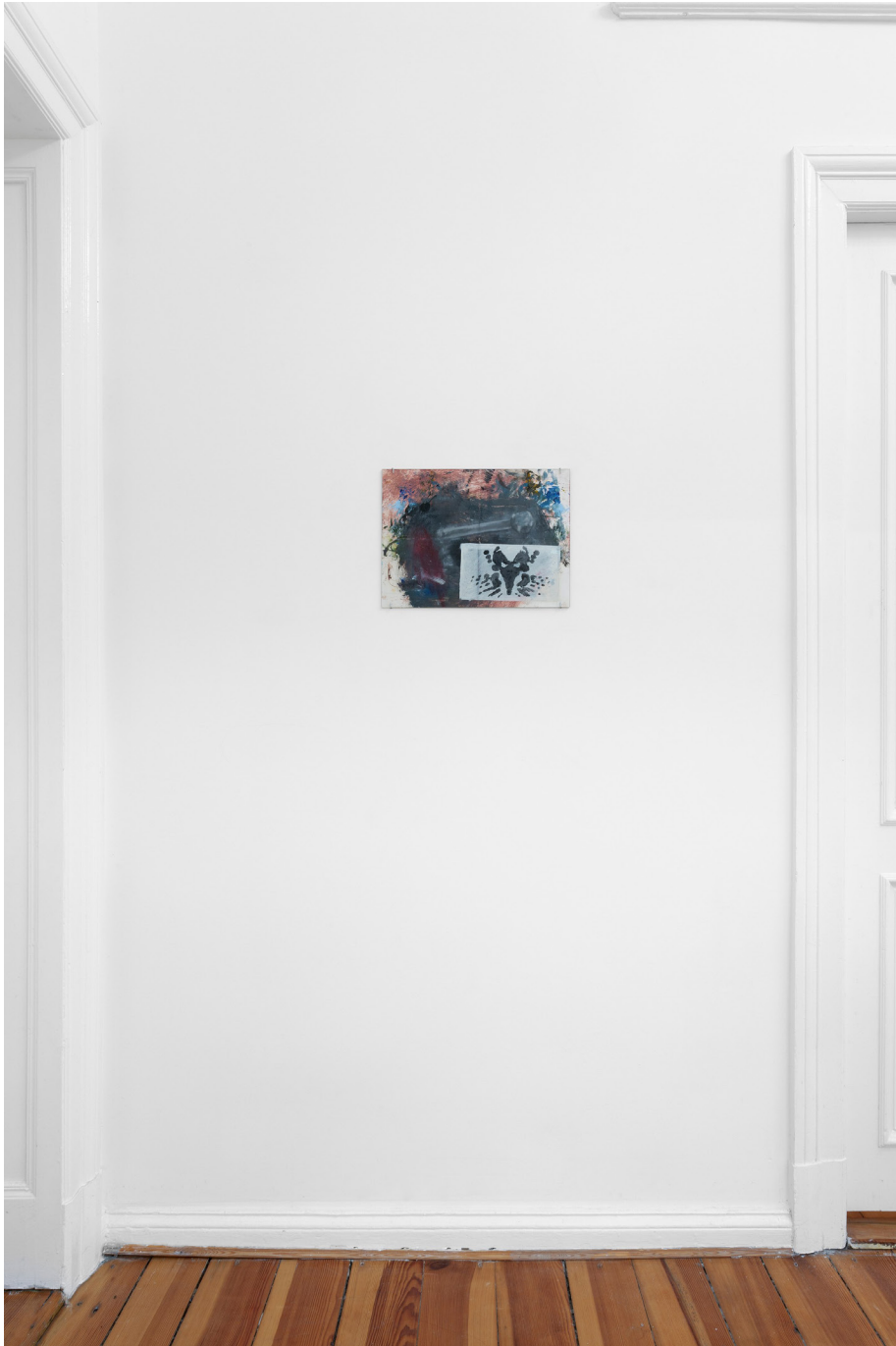
Hydra (or downtown) , 2024, Louche Ops, Berlin, exhibition view