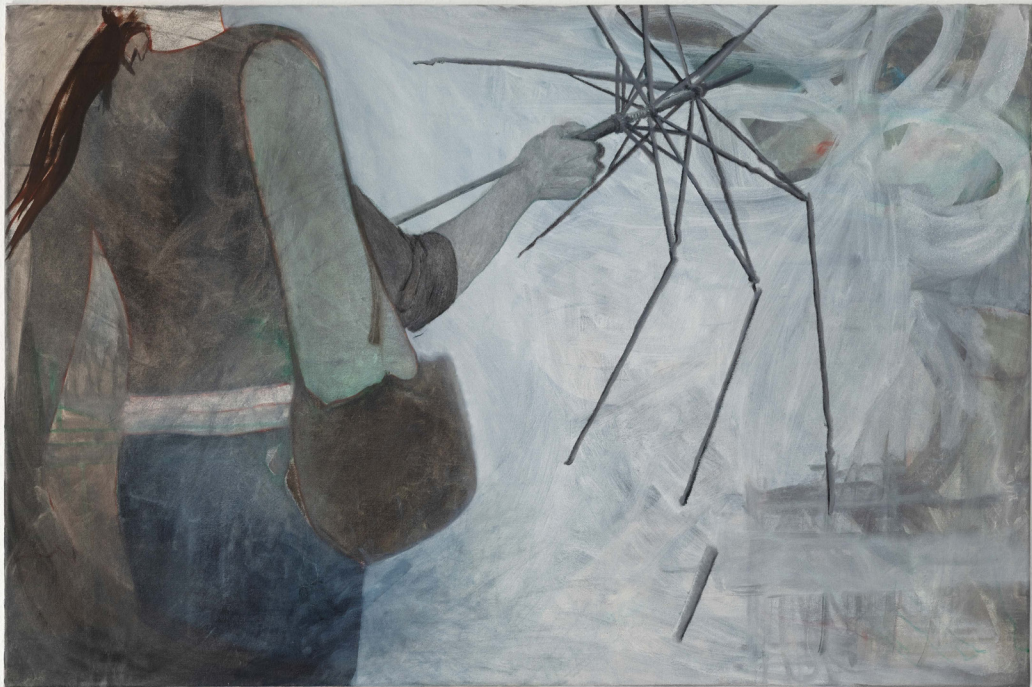
Hydra (or downtown) version II, 2024 Oil, acrylic on canvas 80 x 120 cm