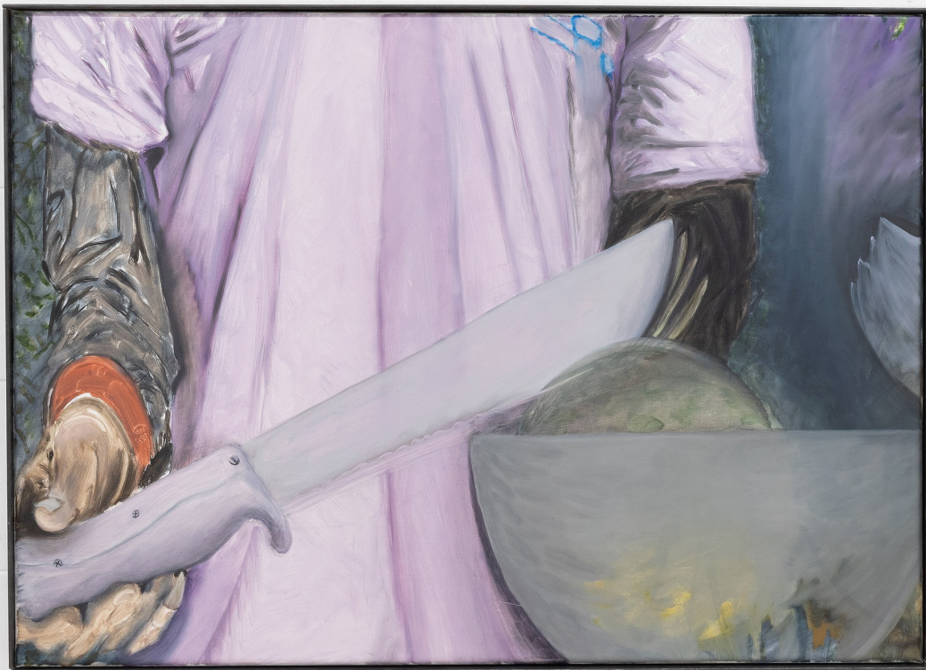
Tantalia , 2023 Oil on canvas 70x50 cm unique