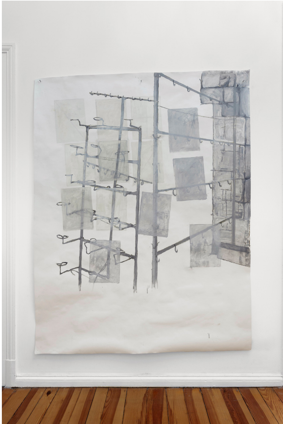
Cairn , 2024 Oil on treated paper 150 x 196 cm