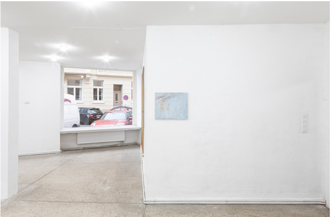
The Hypochondriac's Dream House, 2023, Louche Ops, Berlin, exhibition view