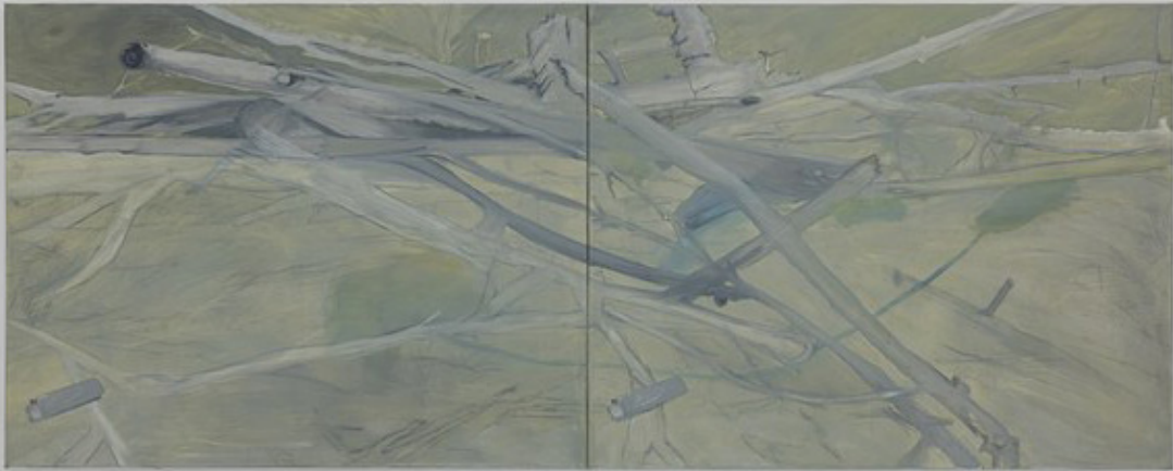
Untitled, 2023 Oil on canvas diptych 80 x 200 cm